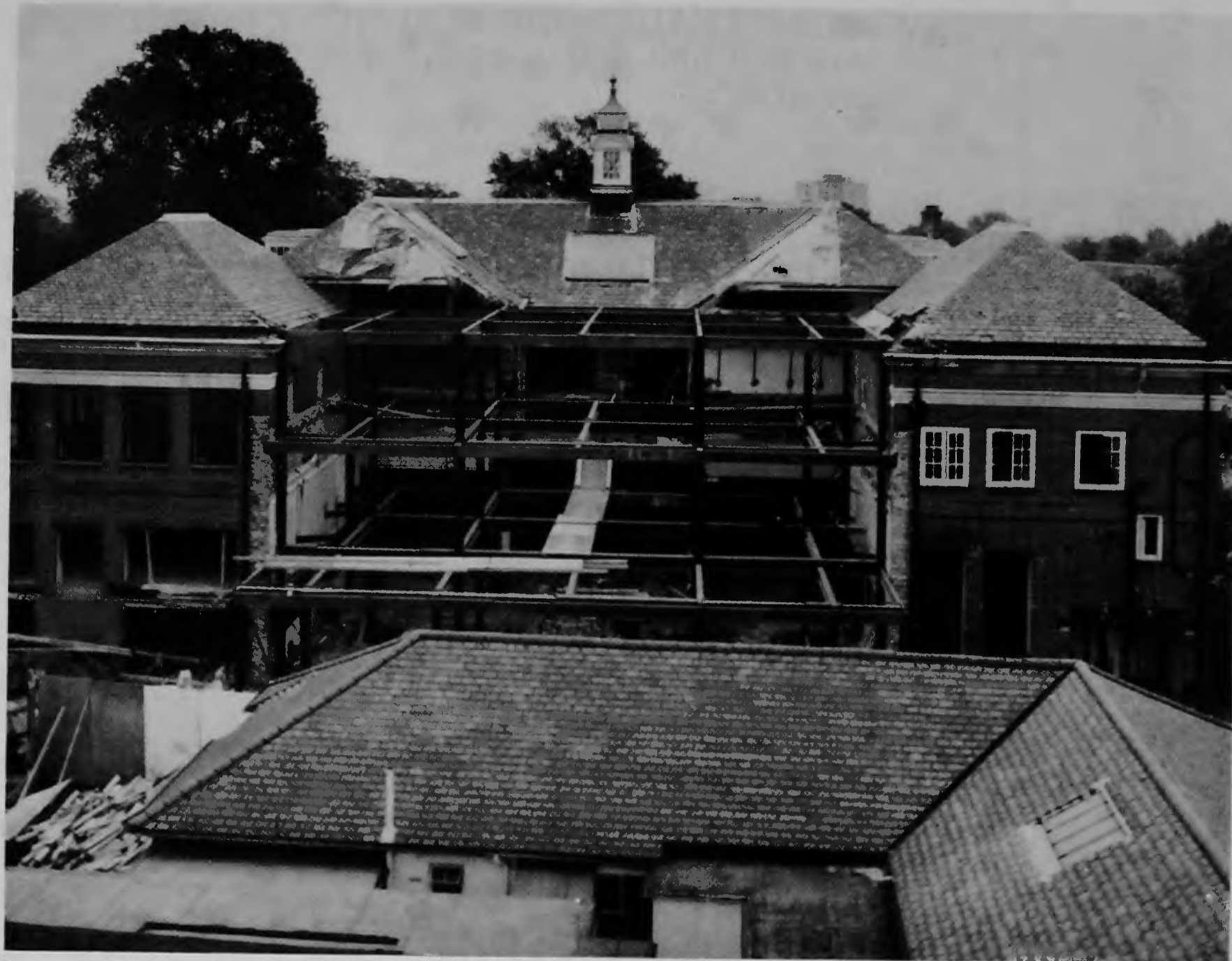
This picture shows the rear of Hendon Library, The Burroughs, where work is progressing well on the major alterations and extensions to the building.