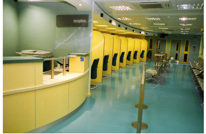
That was then, this is now: Fenella before and after its refurbishment

One of Barnet's busiest enquiries centres has re-opened to the public after being closed for three months for refurbishment.