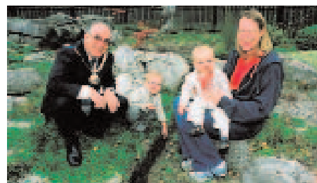
The Mayor enjoys some of the borough's green space with residents

The borough, in competition with its London neighbours, was judged not only on horticultural excellence but also on environmental awareness and