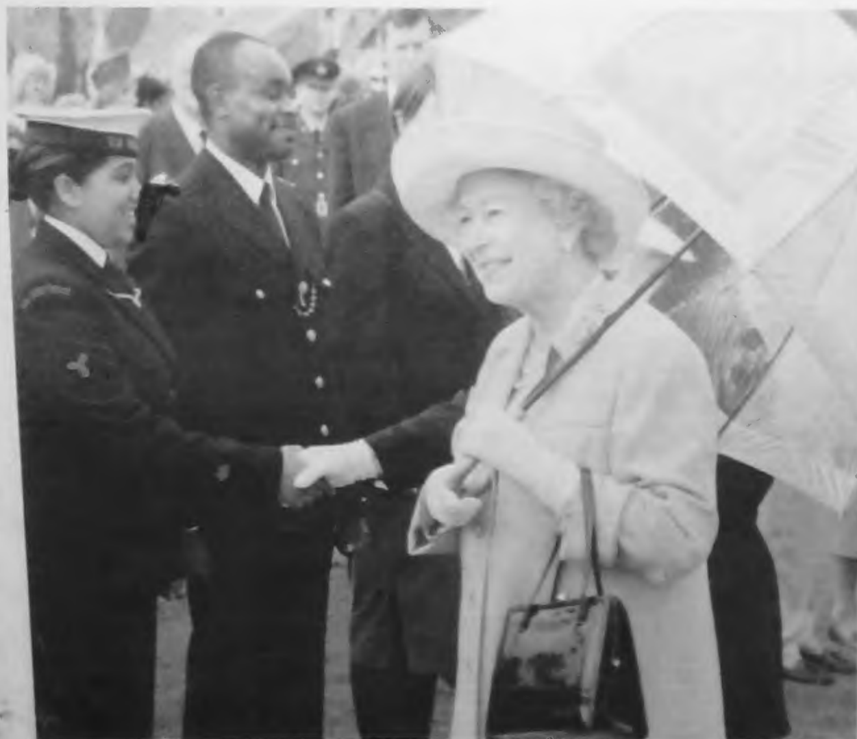
Our Queen visits Cophall (see page 20)

An army of volunteers including over 230 local school children have helped plant trees and flowers in a bid to attract wildlife to the site.