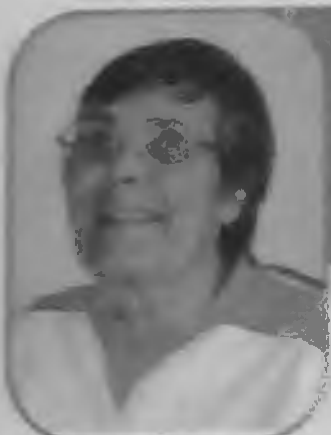
STREET BASED SERVICES OVERVIEW & SCRUTINY COMMITTEE (9 seats) Chair Olwen Evans (Conservative)