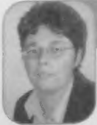
HOUSING OVERVIEW & SCRUTINY COMMITTEE (9 seats) Chair Fiona Bulmer (Conservative)