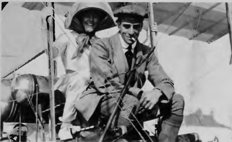
Memories of Hendon Aerodrome

Barnet first is delivered to over 130,000 homes and businesses in the borough. The next issue is out in October.