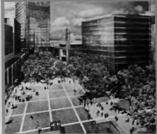
A new look for Cricklewood

Barnet residents have been given the opportunity to have their say on exciting new development proposals for the first stage of the Brent Cross and Cricklewood Redevelopment Project.