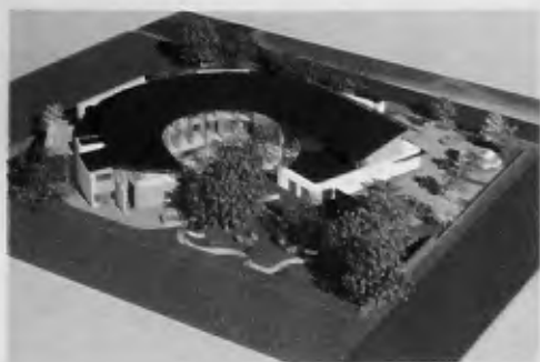
An artist's impression of the new hospice