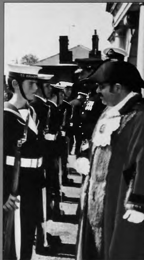
The Mayor inspects cadets from HMS Broadsword