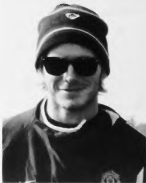
David Beckham wears his shades for charity

Both David Beckham and Councillor Cohen looked seriously cool during the 'Shades For A Day' campaign, but there was a serious underlying message behind the day. The charity hoped that it would raise awareness of buying the correct type of sunglasses and taking regular eye tests.