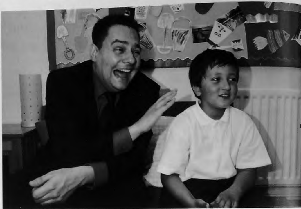
Schools Minister Stephen Twigg enjoys a joke with a pupil during the official opening of new facilities at Queenswell Infant School and Nursery

Around £1.5 million of council funds are paying for the