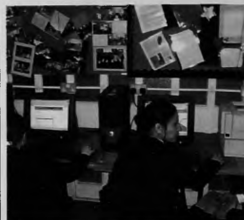
Ravenscroft School pupils at work. Technology College Status will mean new state-of-the-art facilities for the school

"We seek to provide high quality education in a safe, caring and disciplined environment so that pupils are equipped to become responsible citizens in a scientific, technological and international community. Our new status will help us to extend learning opportunities for all our students and our wider community".