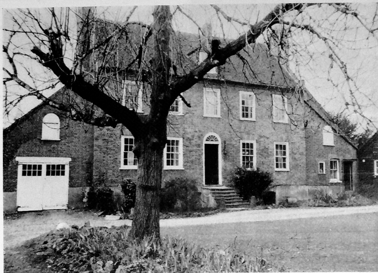
Lawrence Street Farm, Mill Hill