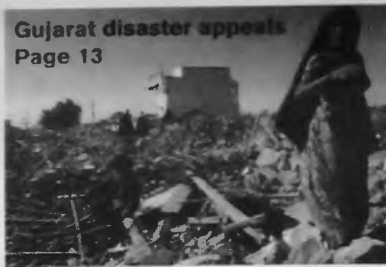
Gujarat disaster appeals Page 13