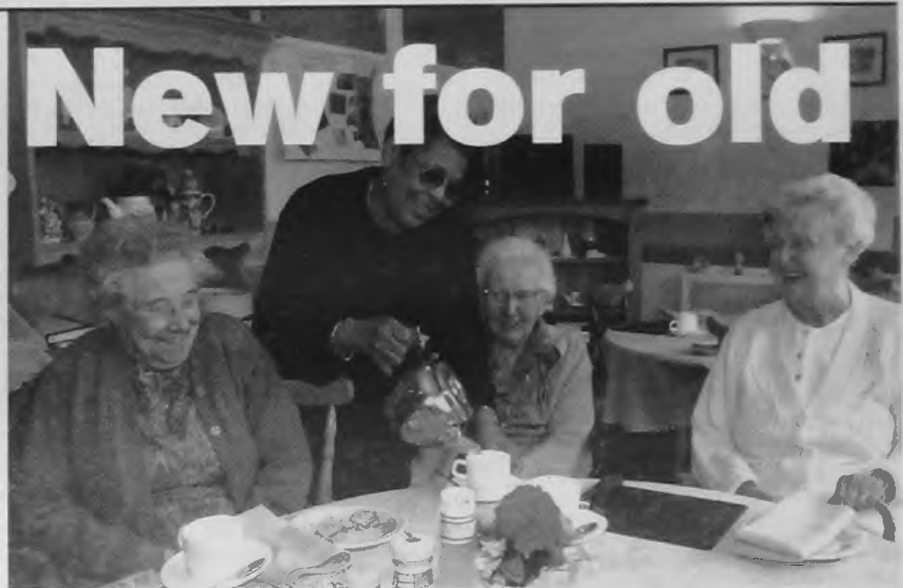
Just our cup of tea: modern homes are on the way for residents, like these at Aphorp Lodge, New Southgate

The programme will begin its work at the start of this year's Summer term.