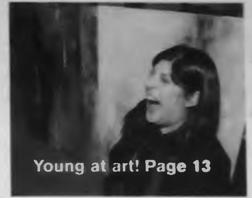
Young at art! Page 13

Published by Barnet Council and delivered to all residents