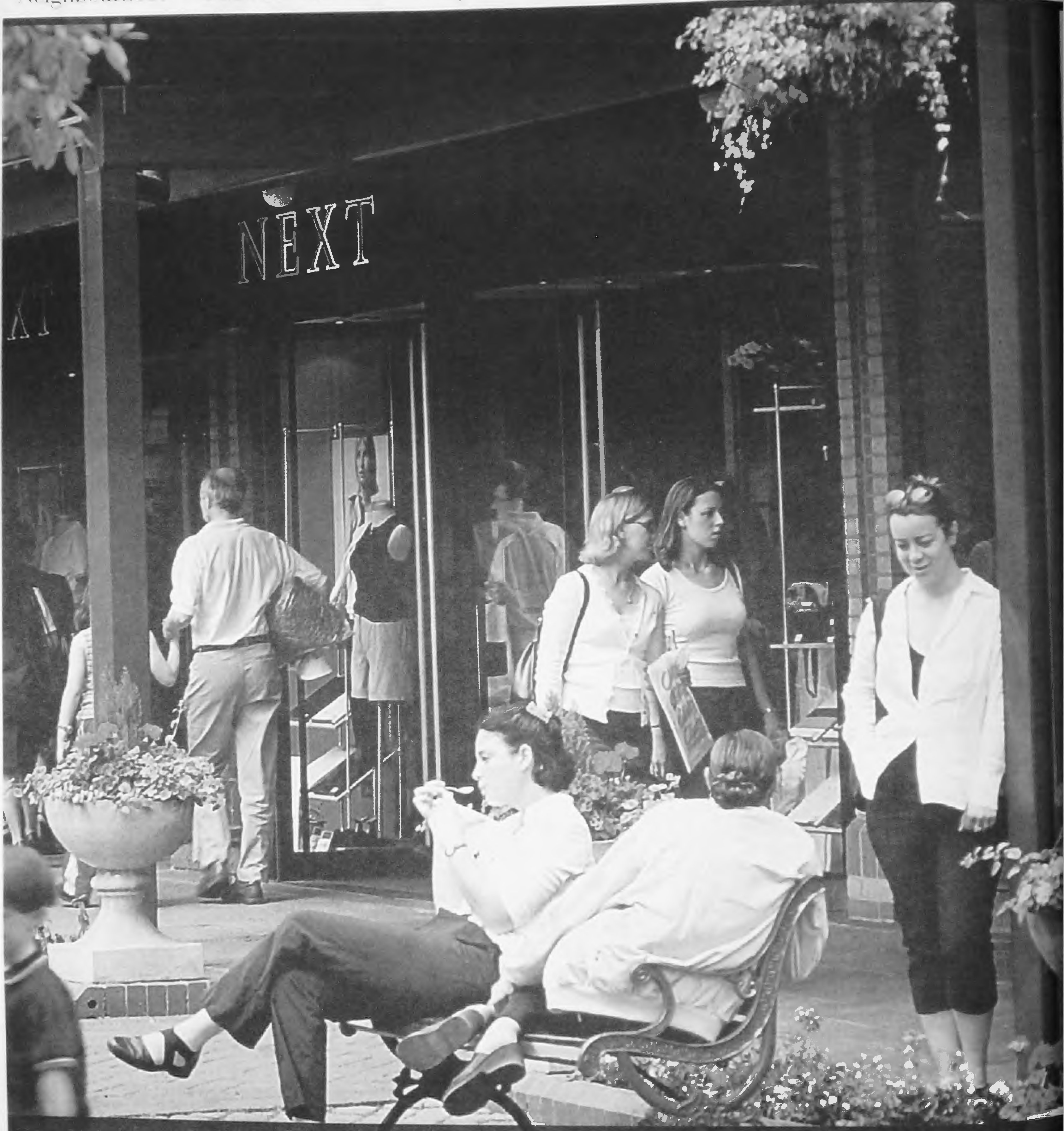
The Neighbourhood Warden Service – helping to make Barnet a cleaner, safer place to live.

In a recent consultation, residents said YES to a Neighbourhood Warden Service. Here we explain what it is.