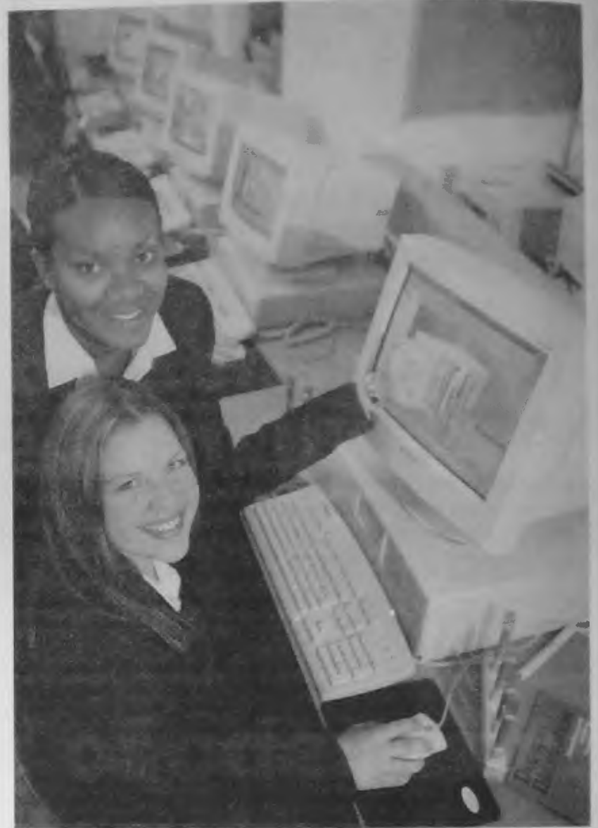
Creating opportunity for all - forty six schools will reap the benefits of a £473,350 award.

Although in England the census form must be completed in English, the questions will also be translated into the 24 most-commonly spoken ethnic minority languages.