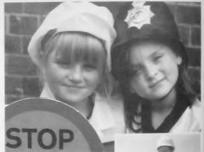
Stop and think about our roads - our security - our future

"The new co-ordinated approach to tackling real problems is already paying major dividends. Councillors and Council officers have worked together to get real, fast results which will have a major impact on the whole community.