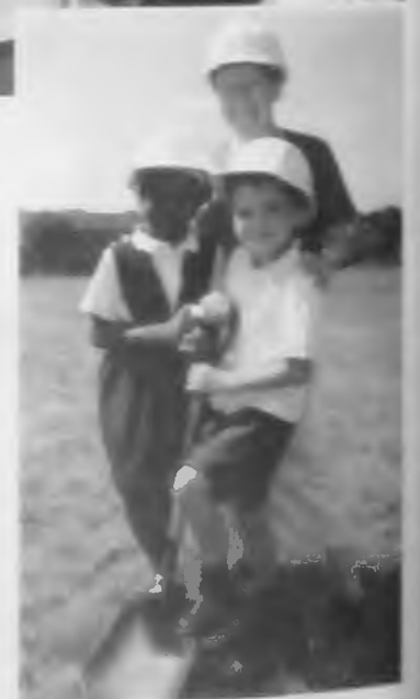
The environment in our hands

"There are no short-cuts to building a better Barnet - but our modernised approach to decision-making and the insistence that all those decisions must create opportunities for all is already yielding both immediate and