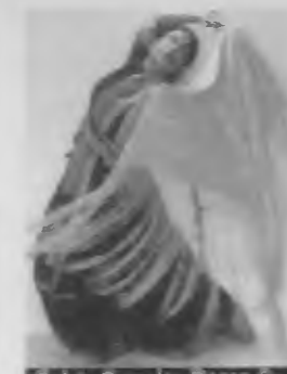
Sujata Banerjee Dance Co.