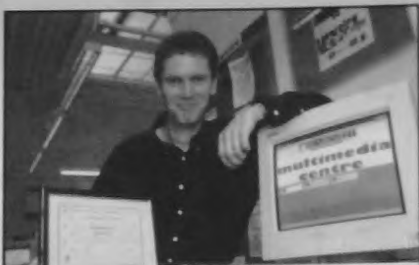
Staff working in Barnet Libraries have begun training in computer skills so they can help library users get the best from 200 new personal computers being installed in libraries over the next two years.

We will continue to consult, listen and learn. And within the resources available meet the challenge of change.