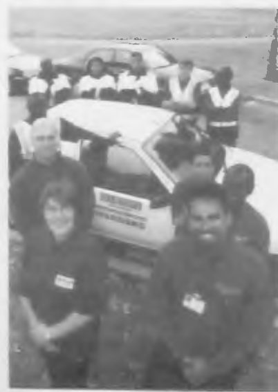
Neighbourhood Wardens take to our streets.

In recent weeks the Council has asked for the views of the community on the future of housing in the Borough, hosted a ground-breaking conference on homelessness and supported housing and set out bold plans for older people's housing in Barnet.