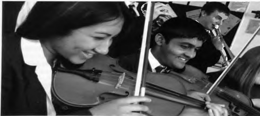
Friern Barnet pupils show off their musical talents

"We have a comprehensive intake of pupils and we are not trying to create a 'Fame School,' - we will continue to function as any other, offering the full National Curriculum - but we want to develop in all our children an appreciation and understanding of the arts that they will be able to carry with them throughout their lives."