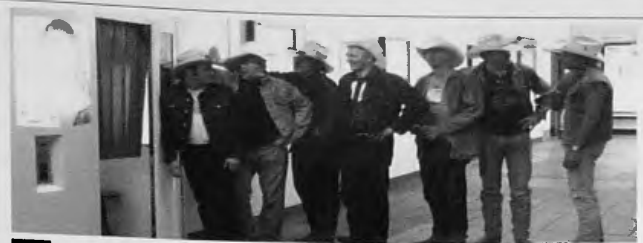
30 April, 8pm. Los Pacaminos. Paul Young and friends play a mix of Tex-Mex classics, Spanish songs and original material with proceeds to charity. All Saints' Arts Centre, Oakleigh Road North, Whetstone, N20. For more details phone 020 8445 8388.

24 April, 2.30pm. The Barnet Branch of the National Childbirth Trust's