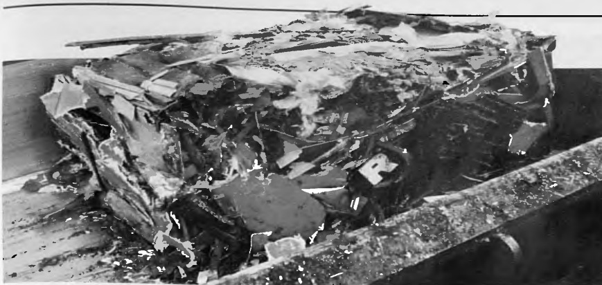
Flytippers beware: All that's left of a flytipping lorry caught in Barnet