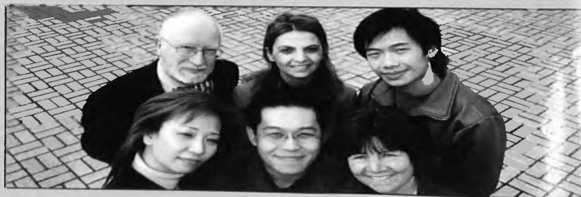
Barnet council's team with members of the borough's Chinese community

The council's work in this area has been commended by Whitehall, and the council has also been awarded Beacon Status for its community cohesion work. The winner of the Local Government Chronicle's award for Community Initiative of the Year will be announced soon.