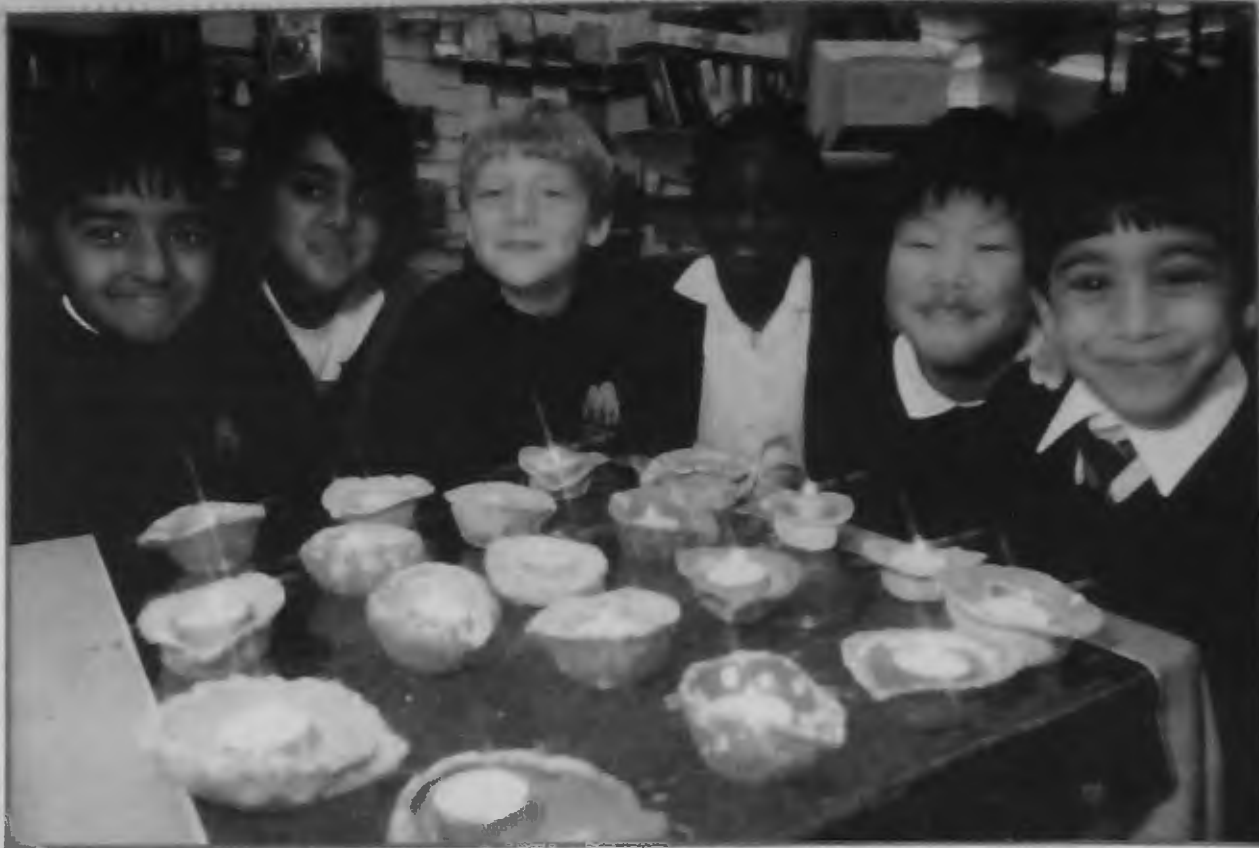
Children from Parkfield School in Hendon are pictured with Diwali lamps taking part in the borough's Diwali celebrations. Youngsters from local schools including Parkfield made the lights during half-term craft sessions at the library which was also the setting for an evening of dance (see right), drama, music and poetry organised by the council and Vivekanada, a Barnet Asian voluntary group.