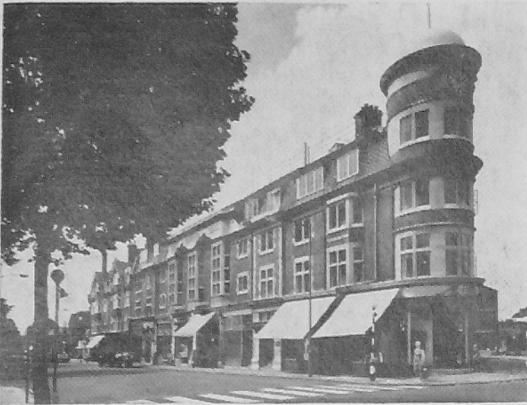
KING EDWARD HALL, Regent's Park Road, Finchley, N.3 Virginia 9121.