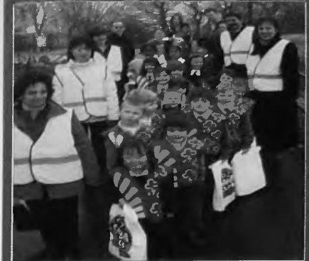
Members of the Frith Manor Kidz Conga walk to school