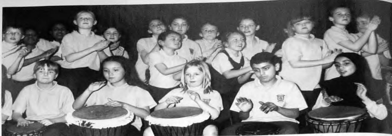
A song and dance from Queenswell junior school at Barnet Schools' Music Festival