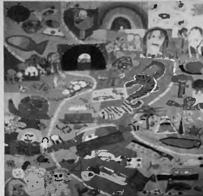
Some of the artwork designed by Barnet's foster children

There is a national shortage of foster parents but since Barnet launched its recruitment campaign in 2002 to tackle the problem locally, enquires from