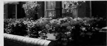
One of last year's finalists makes Barnet bloom