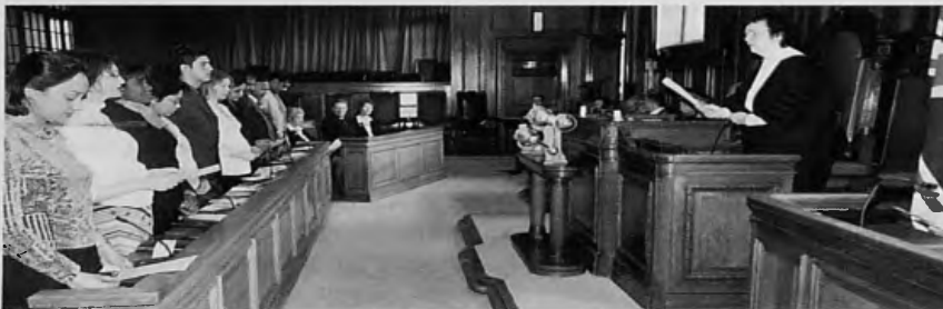
Citizenship ceremony at Hendon Town Hall

For more information on citizenship ceremonies visit the Home Office's web site www.uknationality.gov.uk