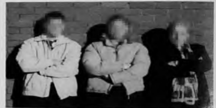
The new corporate anti-fraud team on the look out

Adopting a pro-active intelligence lead approach, much of the new team's work will centre on training council staff so they are aware of how fraud is carried out and can help prevent it occurring in the first place.