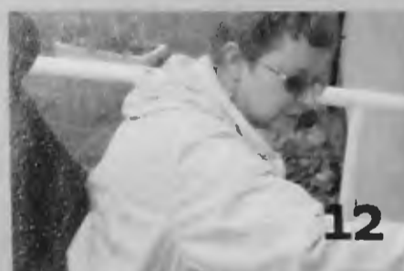
12 Extra Care Housing is coming to Barnet