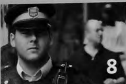
8 Cracking down on crime