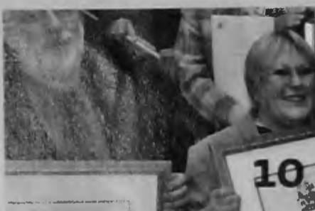
10 Barnet Civic Awards: a chance to say "Thank you"