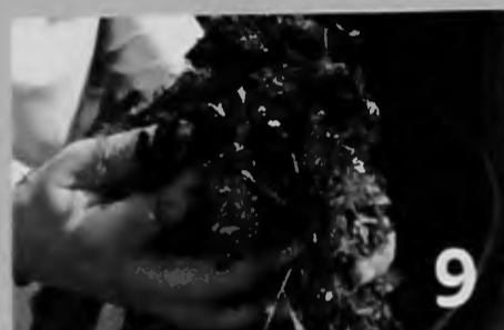
9 Can you recycle more?