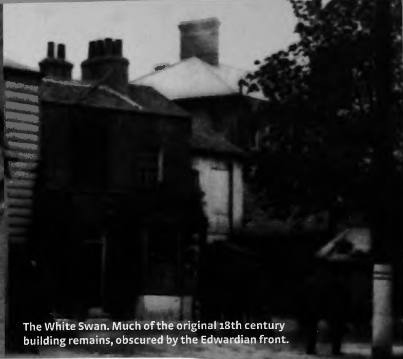
The White Swan. Much of the original 18th century building remains, obscured by the Edwardian front.