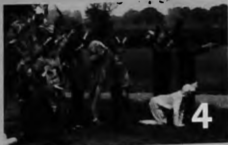
4 Spotlight on your ward – Golders Green