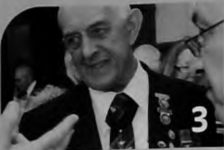
3 Barnet celebrates Veterans Day