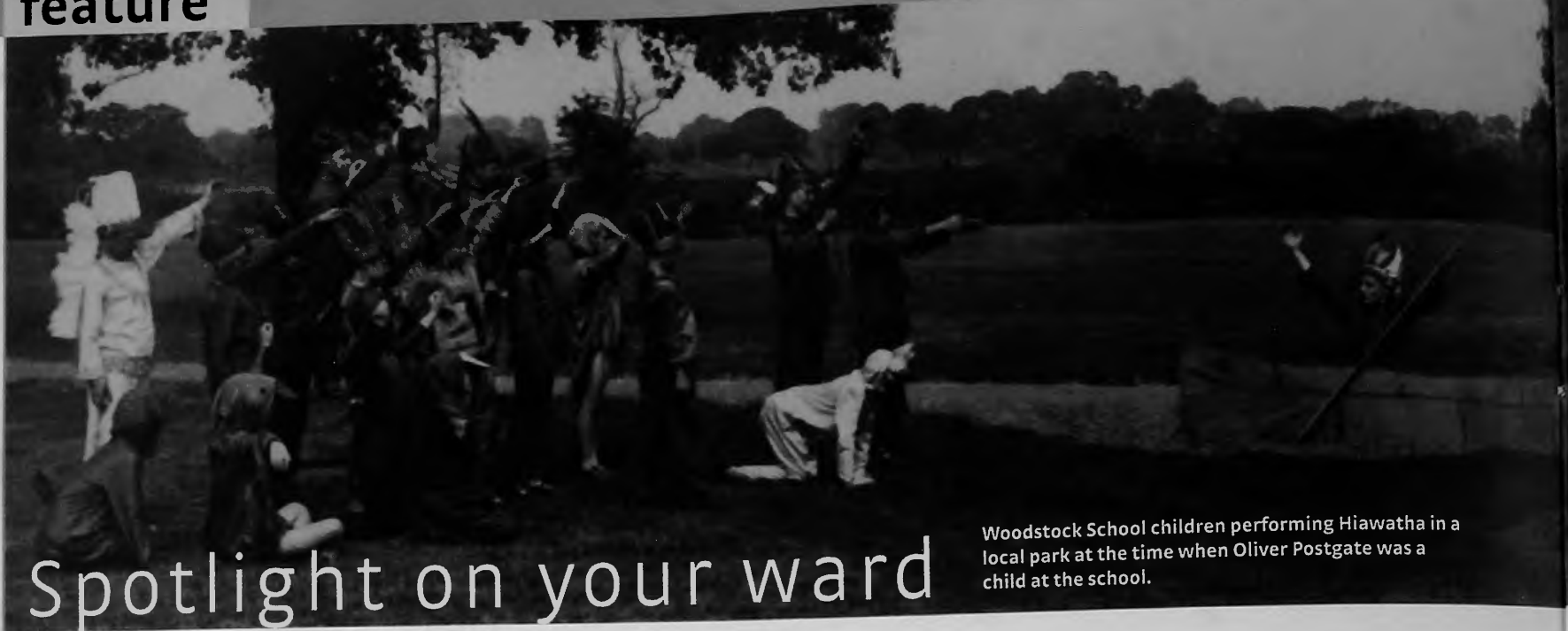
Woodstock School children performing Hiawatha in a local park at the time when Oliver Postgate was a child at the school.