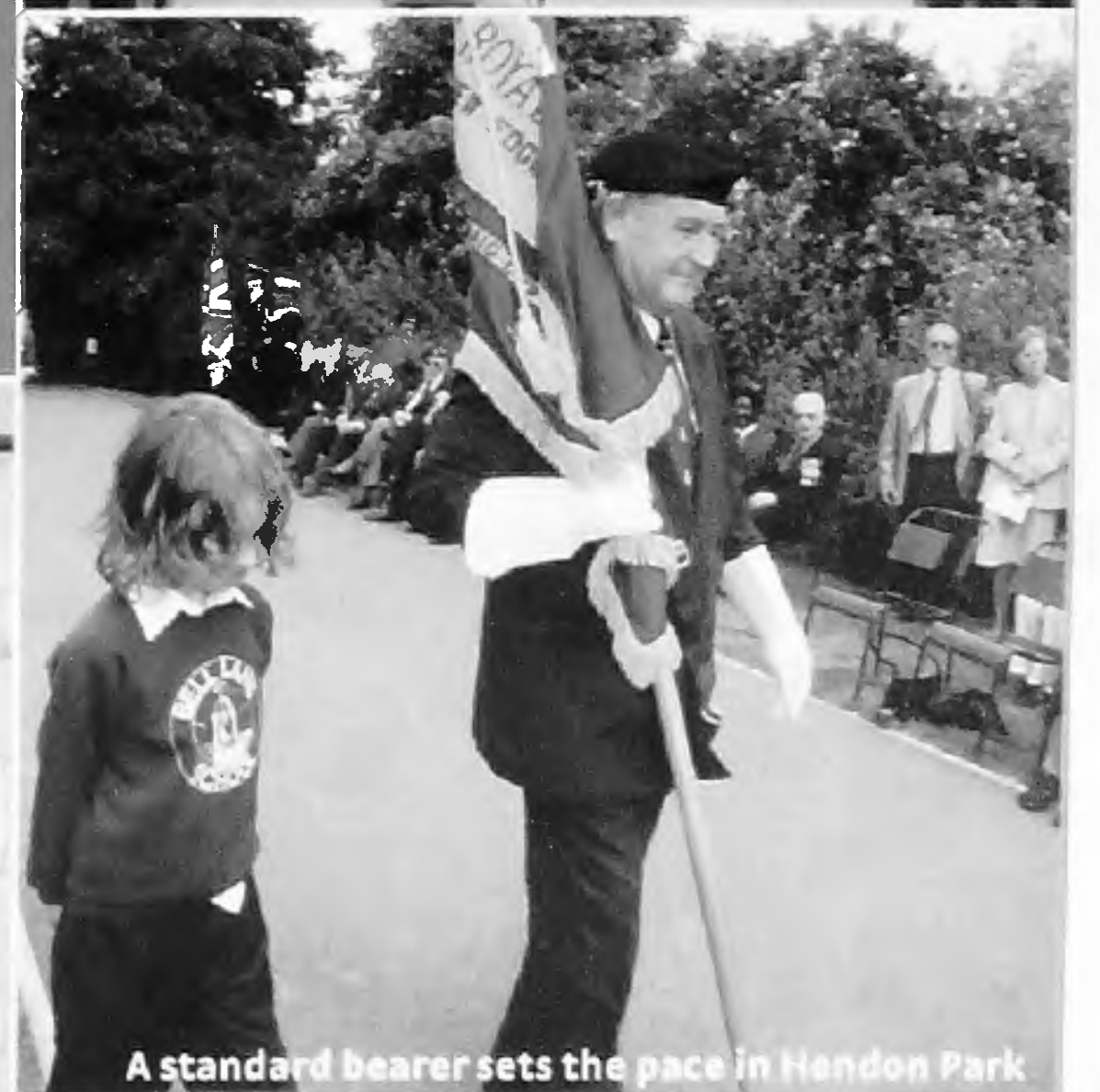
A standard bearer sets the pace in Hendon Park