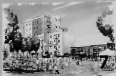
7 Barnet's new homes plans move on apace