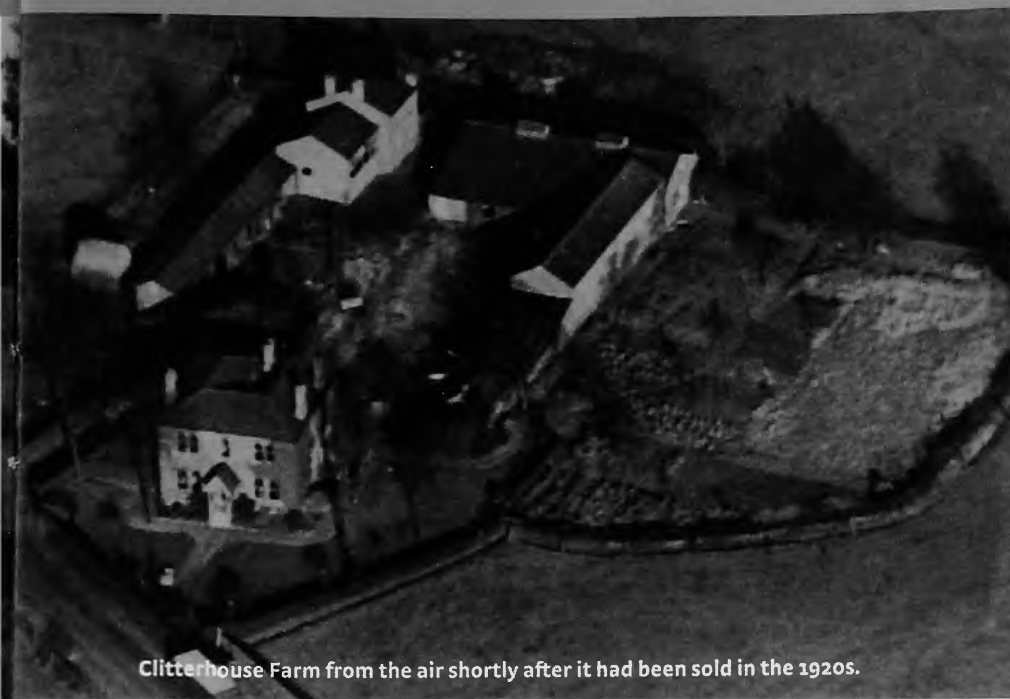
Clitterhouse Farm from the air shortly after it had been sold in the 1920s.