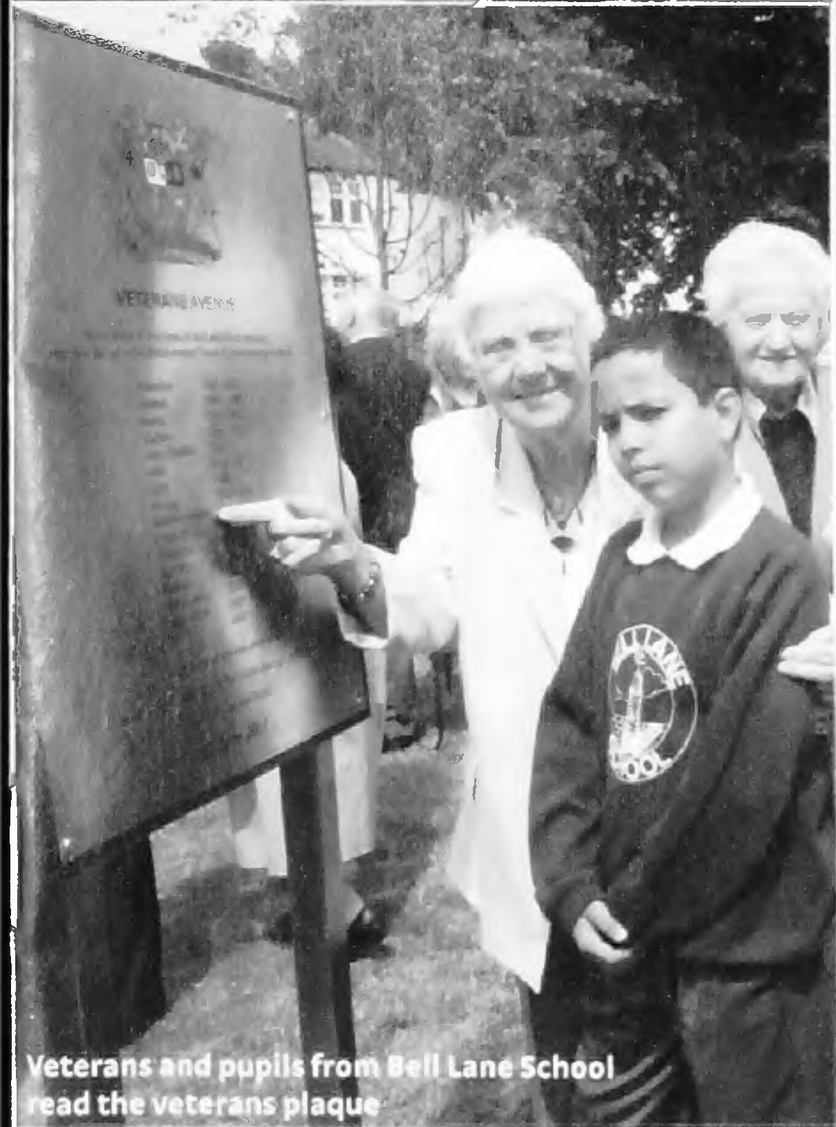
Veterans and pupils from Bell Lane School read the veterans plaque