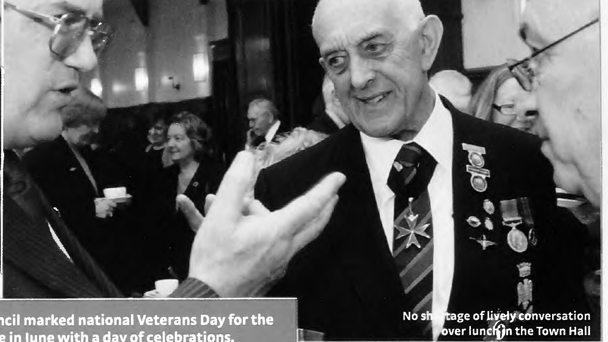
No shortage of lively conversation over lunch in the Town Hall

The council marked national Veterans Day for the first time in June with a day of celebrations.