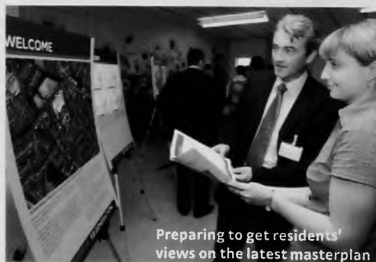
Preparing to get residents' views on the latest masterplan

The plans for Stonegrove and Spur Road will go out for statutory consultation before they are considered by the local planning authority. This will give everyone in the area a chance to see the details of the plans in an exhibition provided by Barnet Council.