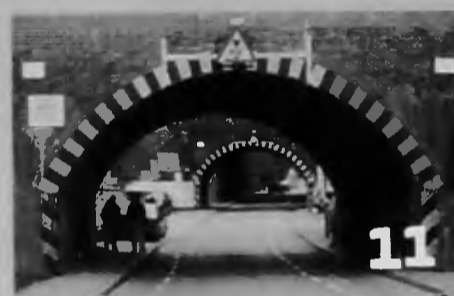
11 Aerodrome Road project begins