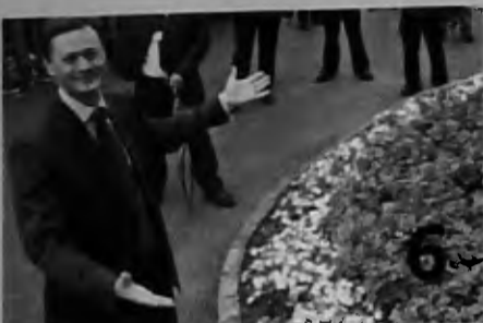
6 Green Flag to fly high as Barnet has six of the best!