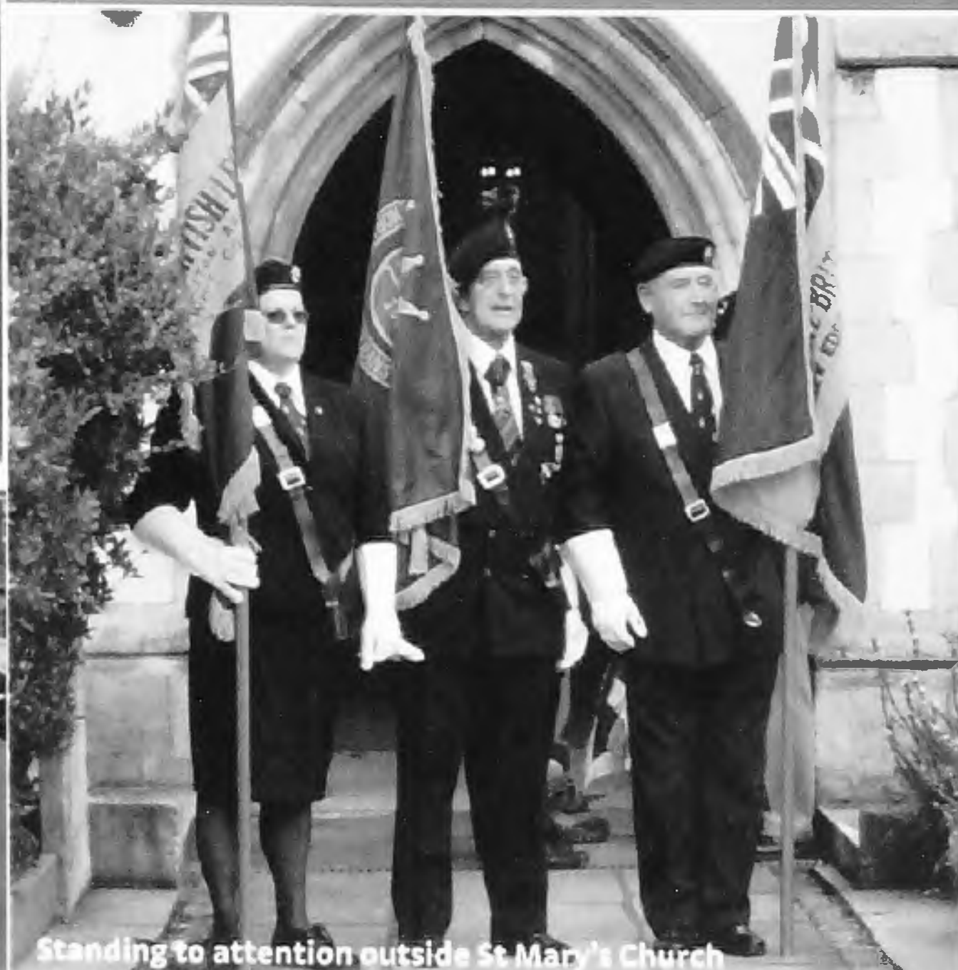
Standing to attention outside St Mary's Church