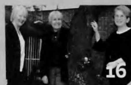
16 Awards for Barnet