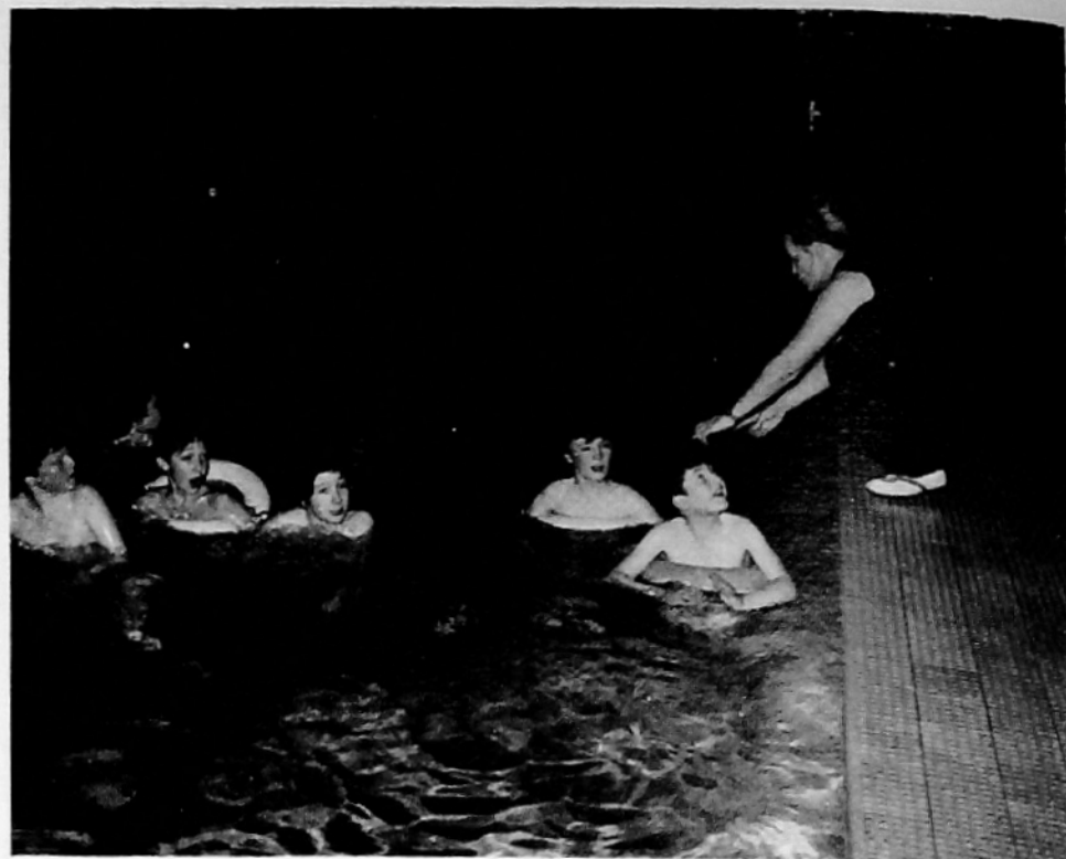
The start of something big? Youngsters get in the swim at Squires Lane swimming pool.

Football Representatives of all the leagues and many individual clubs have been brought together with the result that negotiations are taking place with the Council over such matters as block booking allocations of football pitches, extension of seasons, training facilities and extra pitches within the Borough, although it should be