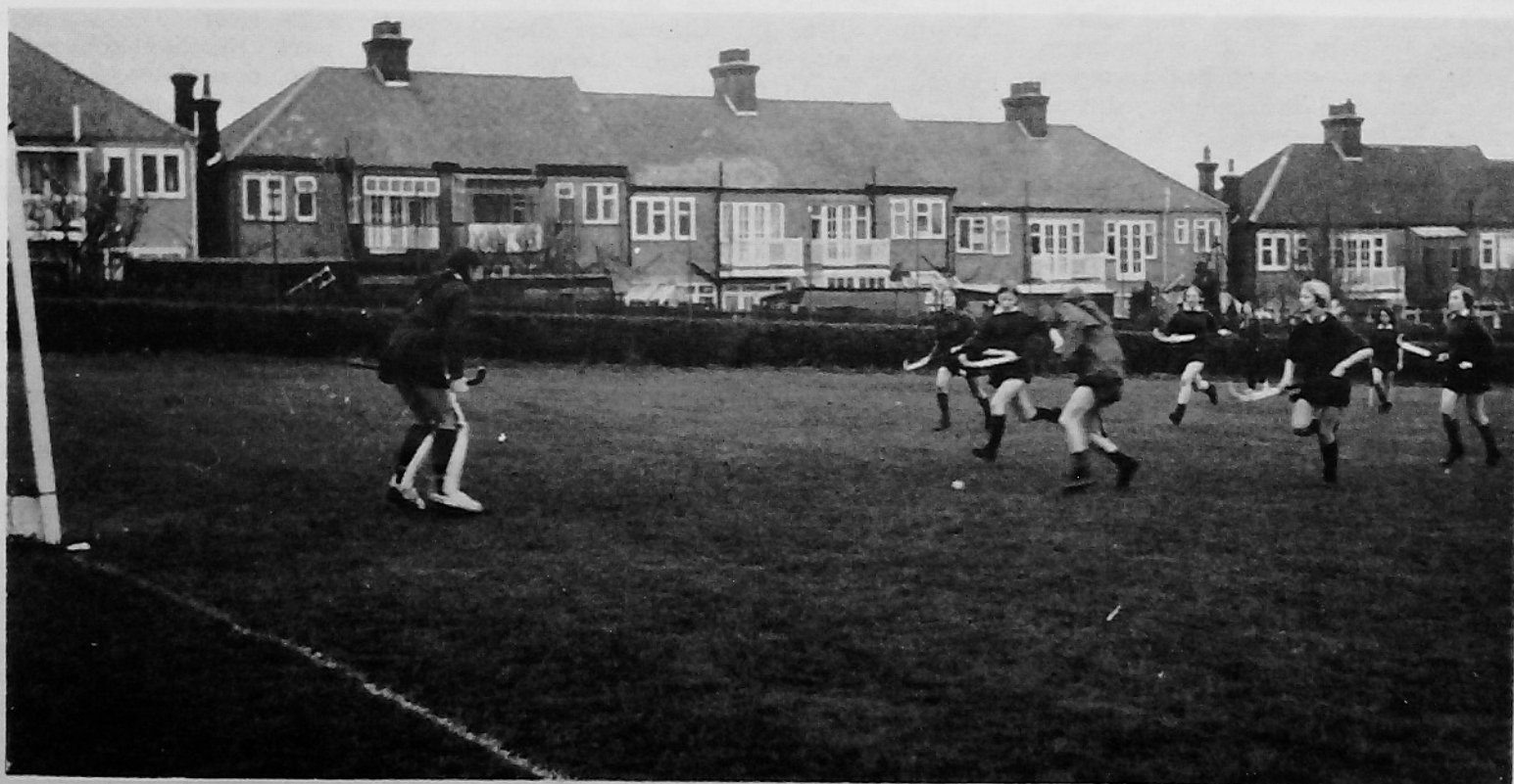
Hockey: An anxious goal-keeper watches an attacking move develop in a game at Hendon Senior High School.