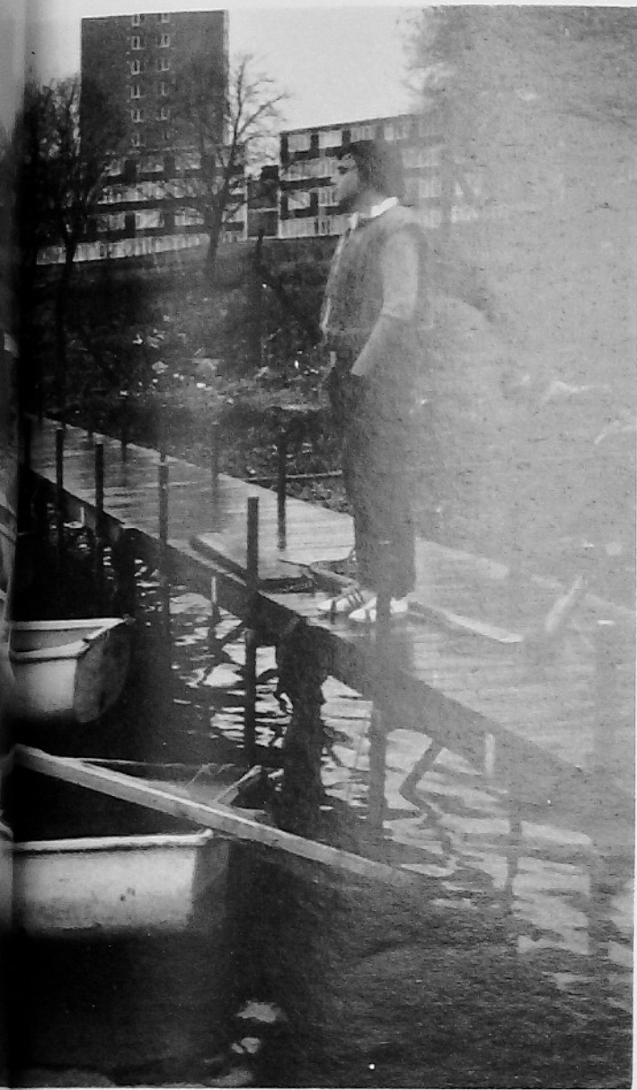
Sailing: Around the world single-handed? Sailing on a wet day at the Welsh Harp.