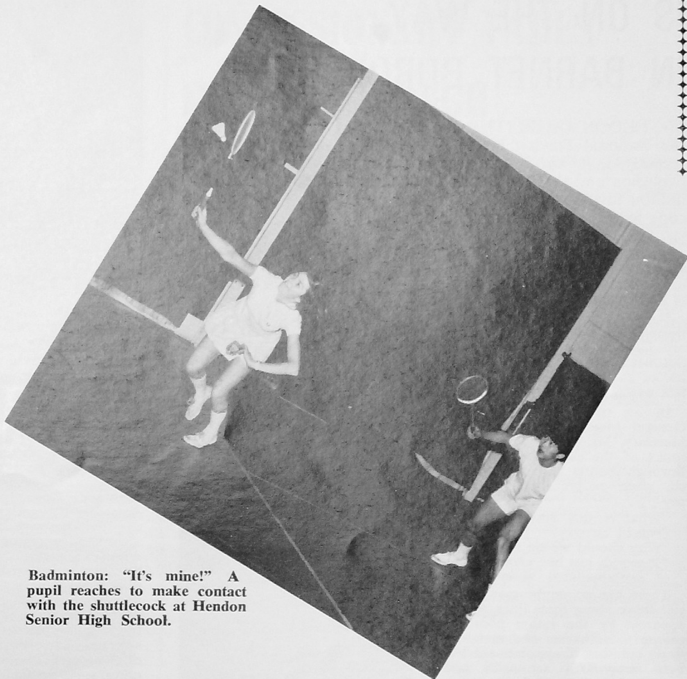
Badminton: "It's mine!" A pupil reaches to make contact with the shuttlecock at Hendon Senior High School.