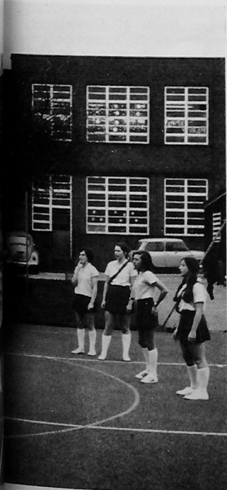
Whose will it be? All eyes on the netball at Copthall School.