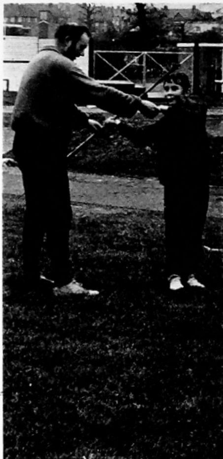
Starting the slow build-up to athletic prowess; javelin throwing at Copthall Stadium.