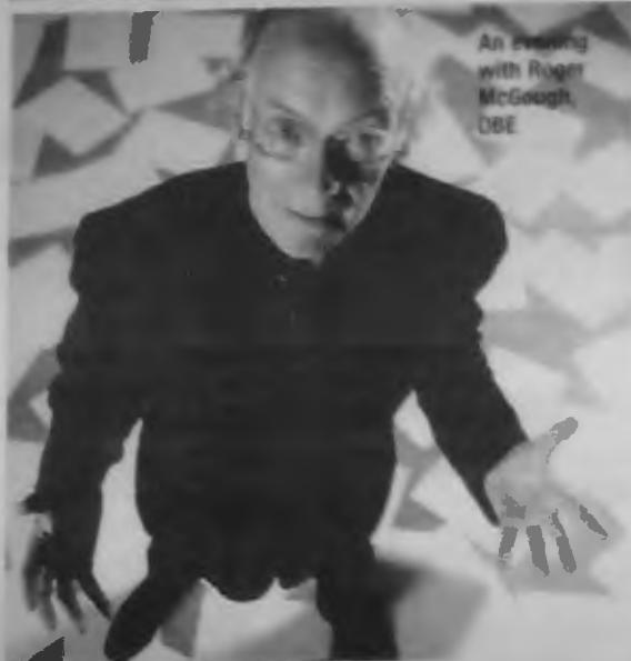
An evening with Roger McGough, OBE