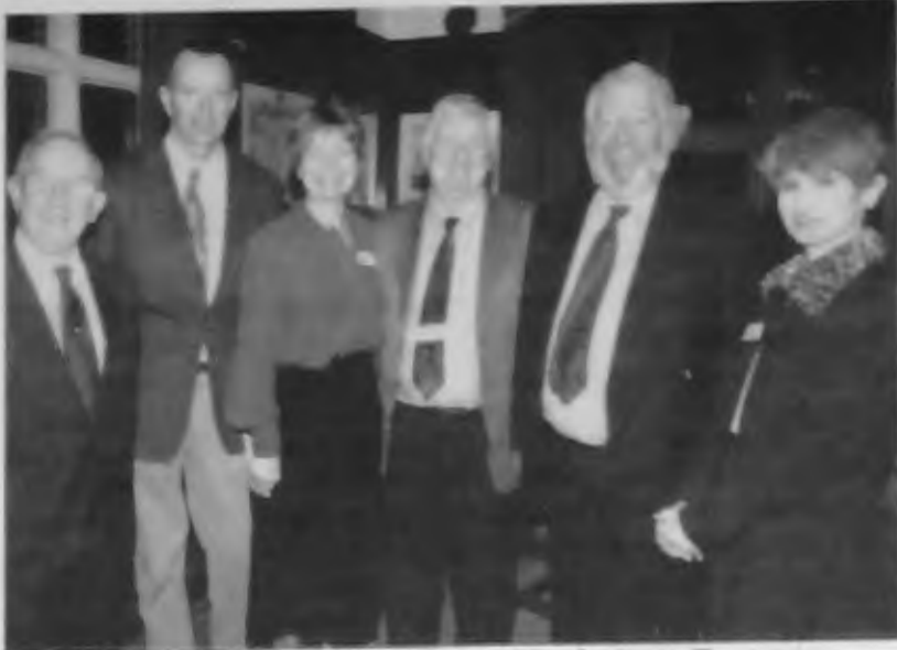
Officials and representatives of the Milly Aphorp Trust join council staff in celebrating achievements

Your vote counts - use your democratic right on 2 May and have your say on the future of the Borough.