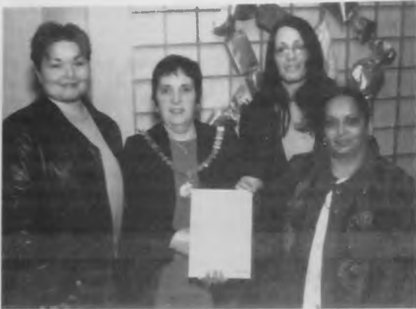
The Mayor joins award-winners