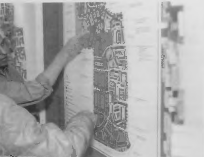
Residents check out the plans at the Grahame Park 'have your say' day.

"These long overdue regeneration schemes create social justice, improved opportunities, enhance the natural and built environment and will have a major