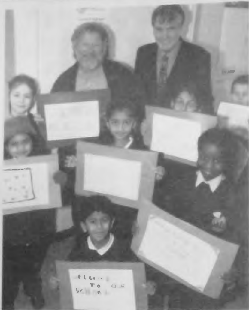
Everyone plays a part - children from Parkfield School, West Hendon, hear what their role will be in the clamp-down on litter and graffiti.

So far the tippers have struck at sites ranging from Hendon Football Club in the south of the Borough to Edgware in the north. Supermarket car parks, access roads, approaches to building sites and