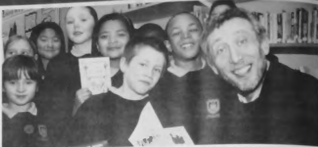
Children's author Michael Rosen joins pupils to celebrate the opening of major new extensions at Deansbrook Junior School, Hale Drive, Mill Hill