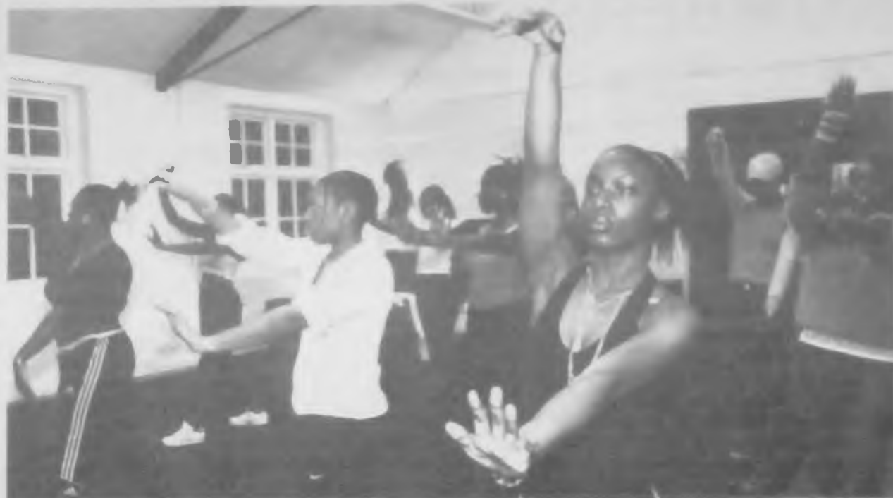
Local young people get in the swing during the street dancing workshop

Urban-acts is designed to give the thousands of young people in Barnet aged 13 to 25 the chance to get hands on experience of the arts and to create long-