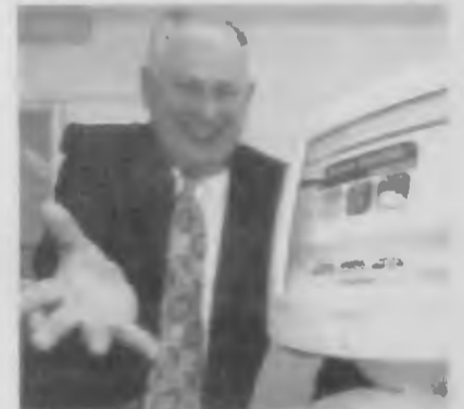
Getting the message of success - all you ever wanted to know about our town centres.

Exploring the website at its launch at Hendon Library's multi-media centre, he stressed that Barnet's town centres drove the local economy. The website, www.towntalk.co.uk includes information on shops and services, special promotions, maps, links to other useful sites and an e-postcard facility. Individual sites for each of Barnet's 20 town centres are accessible via the homepage.