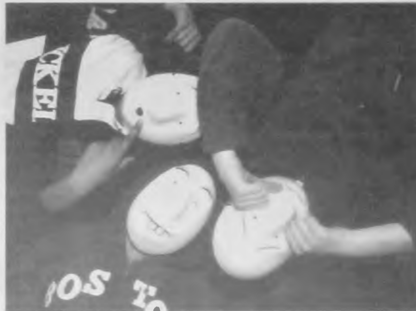
Putting on a brave face - and tackling the rigours of one of the acting classes