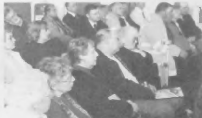
Local residents hear of the lasting benefits of the scheme for their community.