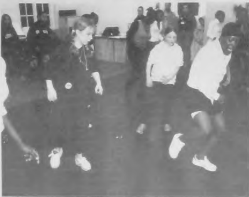
Stepping out in dance to celebrate youth

In addition to the Council, the 'opportunity for all' programme is being supported by the Regional Arts Lottery Programme and London Arts.