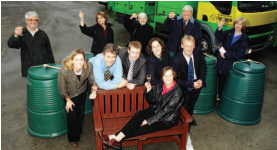
Officers from the council's Environmental and Neighbourhood Service and ECT join the winners of the "Recycling – So Simple, It's Easy" competition