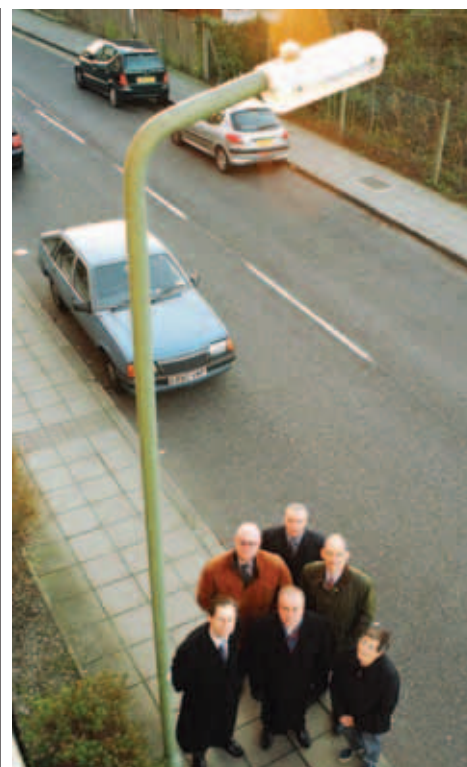
Councillors and officers celebrate the council securing £27m for street lighting improvements