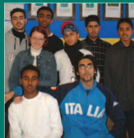
Young entrepreneurs from The Ravenscroft School who won the Barnet Business Challenge

Pupils from The Ravenscroft School in Totteridge proved they had a head for business when they scooped first prize in the Barnet Business Challenge.