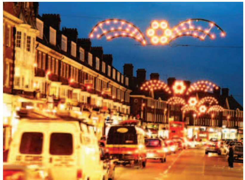
Golders Green town centre was just one of many to benefit from grants for festive lighting

Areas to benefit from grants for Christmas lights included Golders Green, Edgware and East Barnet.