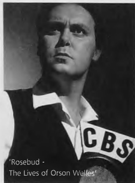
'Rosebud - The Lives of Orson Welles'

Avalon bring a riotous line-up of comic geniuses to artsdepot for a series of Edinburgh Fringe previews.