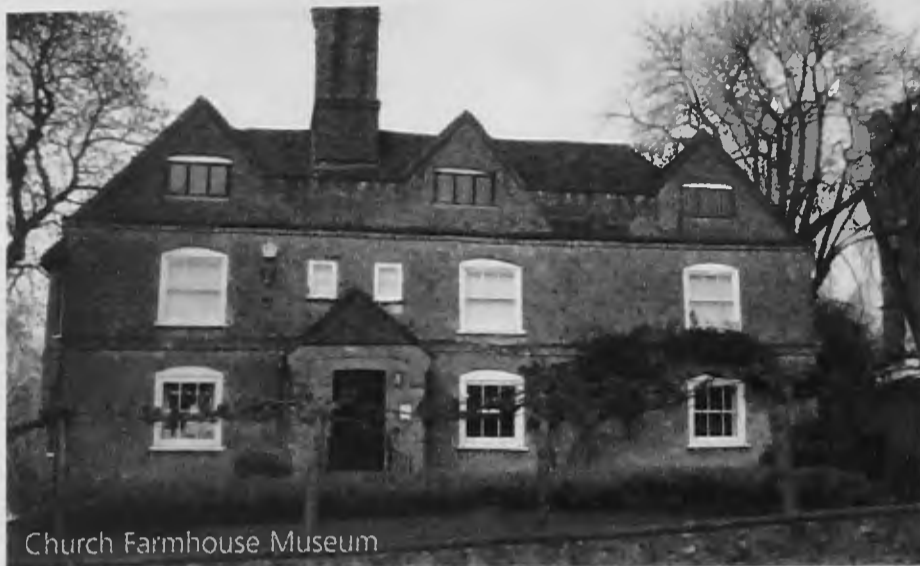
Church Farmhouse Museum

5 Nether Street, Tally Ho Corner, North Finchley N12 0GA 020 8369 5454. artsdepot brings you the best of Latin American