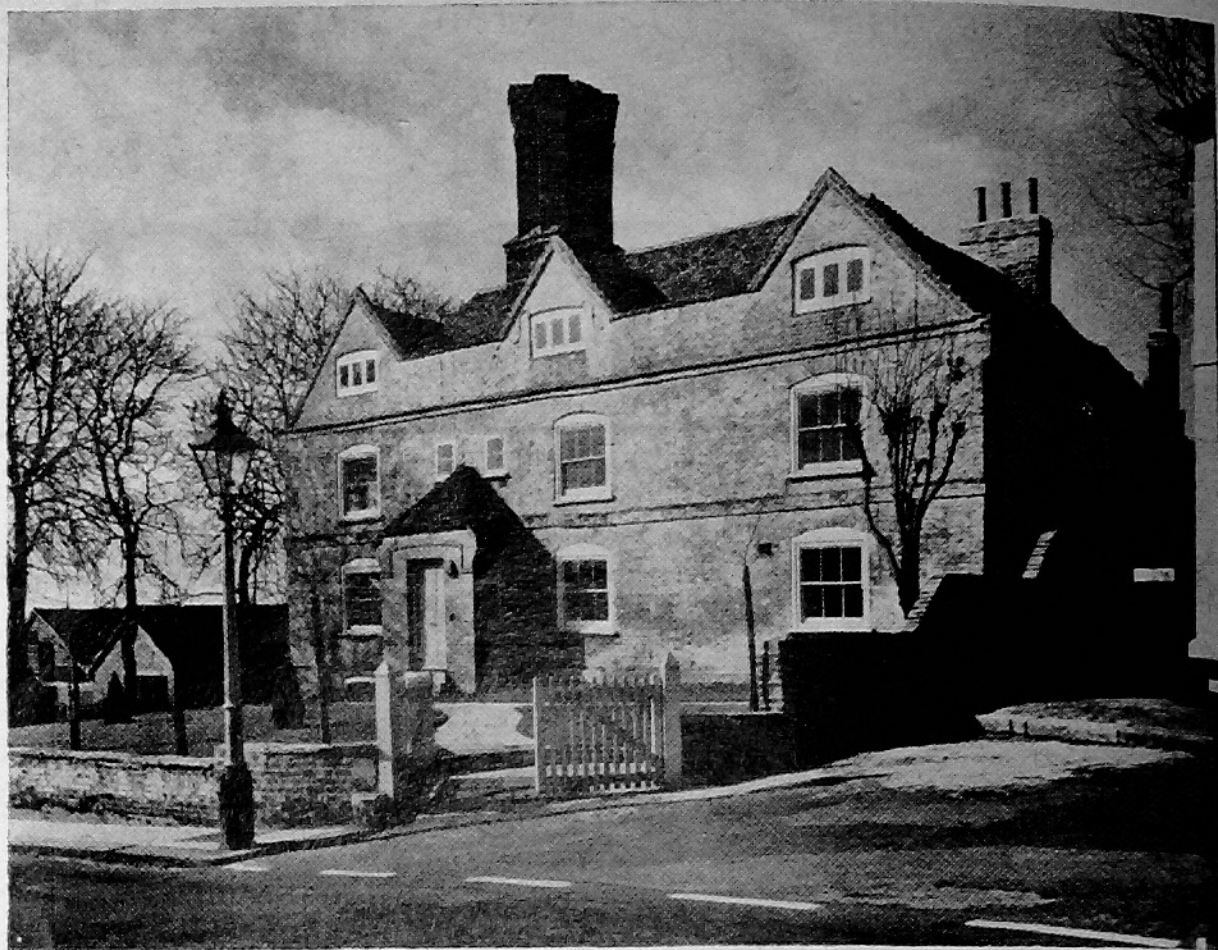
CHURCH FARM HOUSE MUSEUM, Greyhound Hill, N.W.4.

Continually changing exhibitions are mounted in the three first floor rooms of the Council's museum, whilst the ground floor rooms are furnished in period style. Perhaps the oldest surviving dwelling house in Hendon, its main part dates from mid or early 17th century, although it is probable that a house stood on the site before that time.