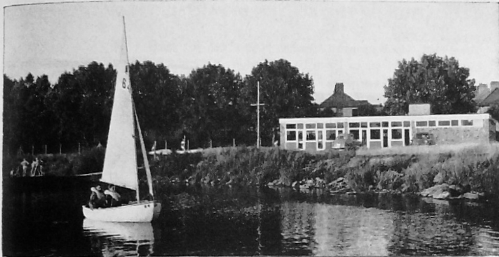
A view of the Welsh Harp Sailing Base, Cool Oak Lane, Hendon, which provides excellent facilities for young people to learn the arts of sailing.