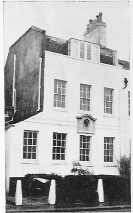
Livingstone Cottage, Hadley Green

He served for many years as a member of the Town Planning Committee of the Association of Municipal Corporations, and is at present Chairman of the Buildings and Town Planning Committee of the London Borough of Barnet.