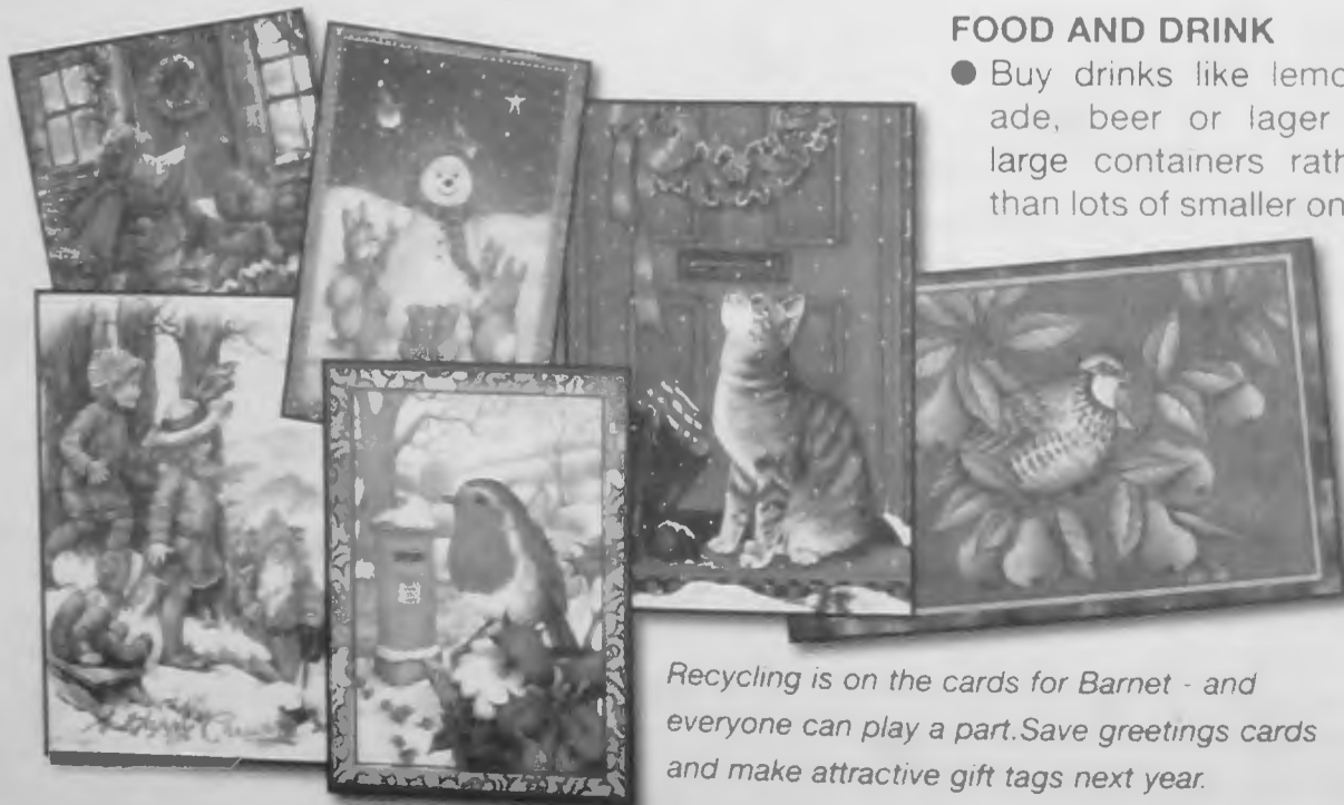
Recycling is on the cards for Barnet - and everyone can play a part. Save greetings cards and make attractive gift tags next year.