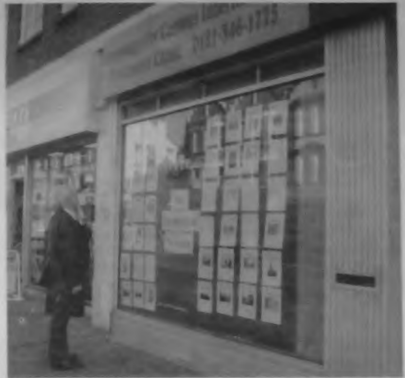
The display at 138 Ballards Lane, Church End Finchley, attracts admiring glances from a passer-by

Other competitions for all sectors of local communities are planned as the Council extends the scheme across the Borough.