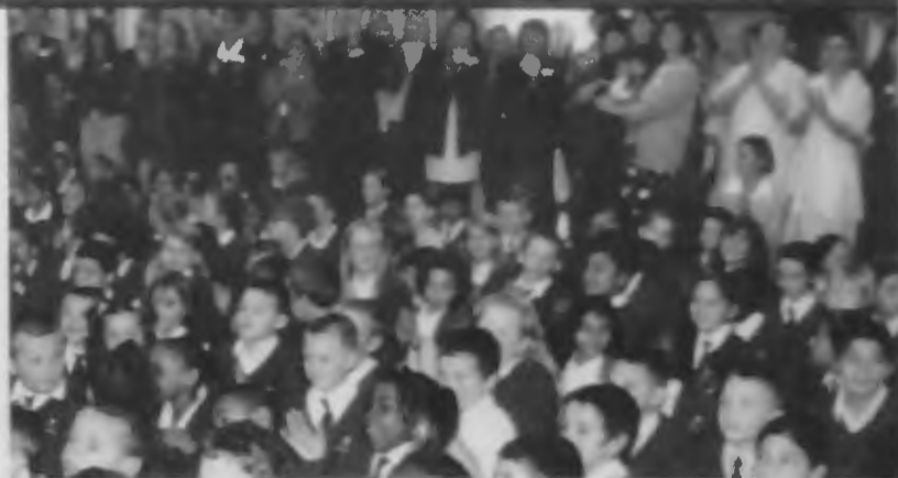
Jane Asher, President of the National Autistic Society, opens the new Kingfisher unit at Livingstone Primary School as (above) the school looks on (full story in our education supplement)