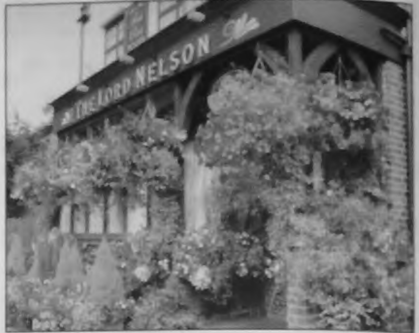
Best Bloomin' Pub the Lord Nelson

A new trophy for the Hampstead Garden Suburb Residents category was provided by Temple Garden Fortune Garden Centre and Earth Anchors Ltd. provided a trophy for the Best Bloomin Pub.