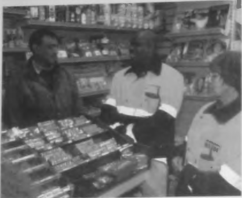
Wardens meet a trader in Burnt Oak's Watling Avenue.