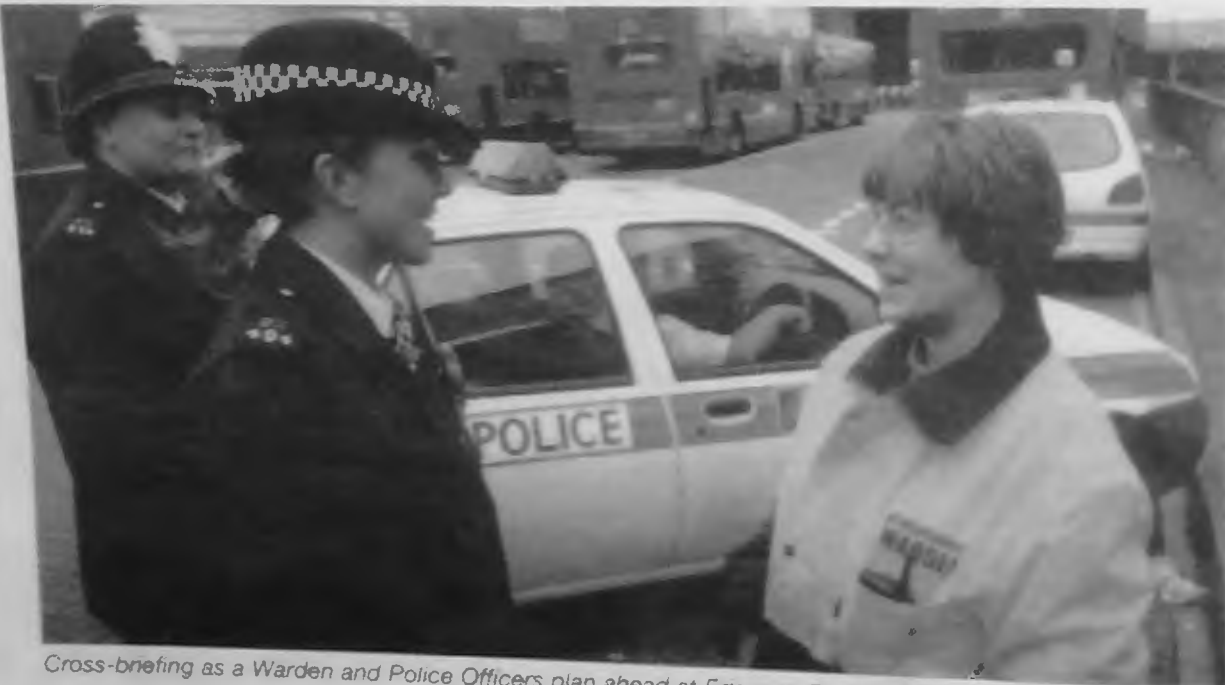
Cross-briefing as a Warden and Police Officers plan ahead at Edgware Bus Garage