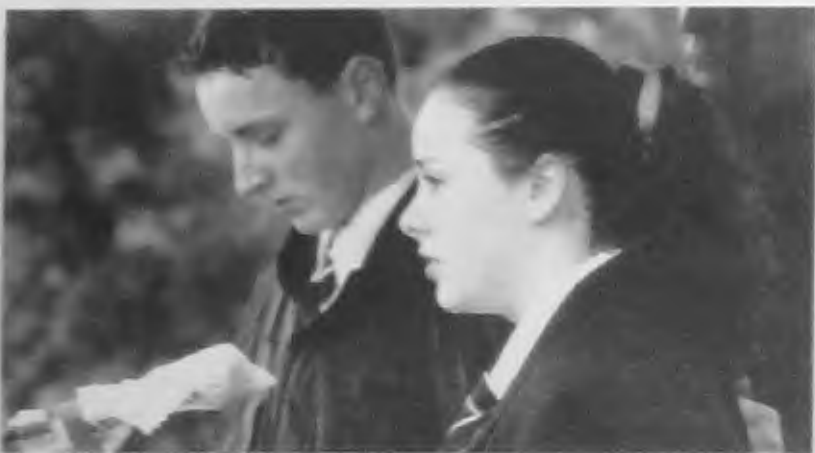
Students from St. James' Catholic High School read a statement of commitment.