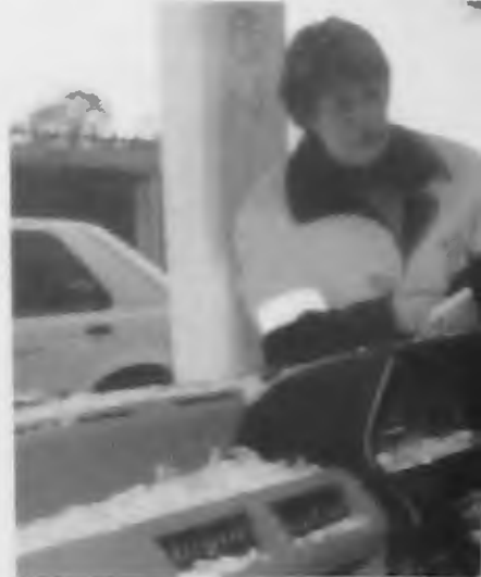
Another abandoned car goes under the hammer.

Police set up a cordon at the exit from the estate and all vehicles were checked as they drove out. More checks were carried out by a team of DVLA officers at various locations in the surrounding areas.