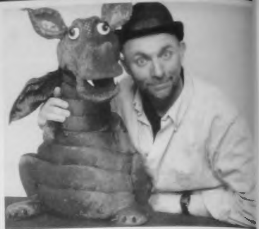
The Marvellous Magical Coat Puppet show - just one of the many and varied attractions

A dedicated area for children, exhibition centre featuring services provided