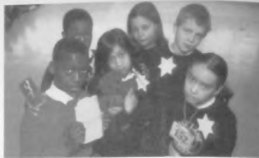
Children from Bell Lane Primary School represent Kinder transport children as they re-enact horrors of past.

The Council produced information packs for all our 121 primary and secondary schools including a story based on the experiences of German Jewish children who became refugees in this country because of Nazi persecution. There was also an account of a