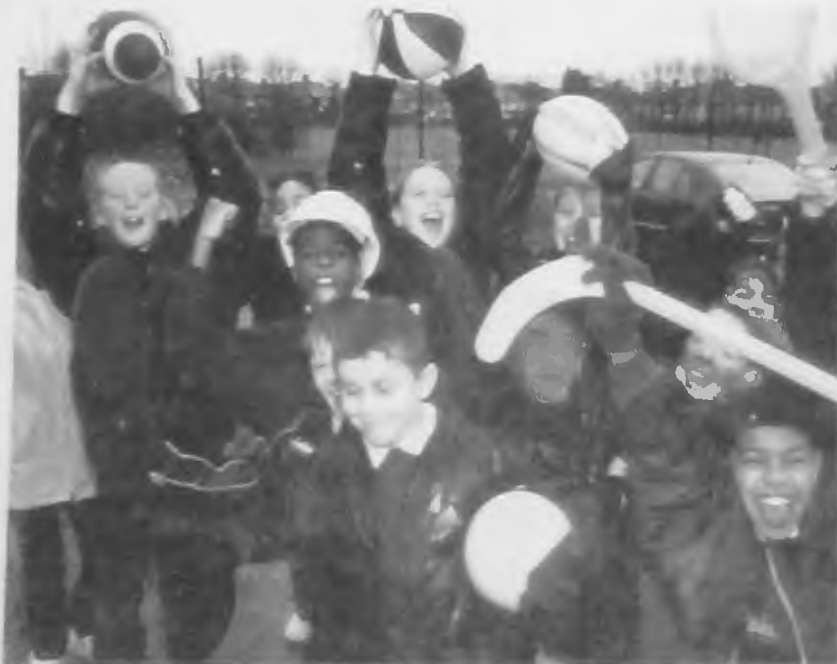
Local Young people join in the celebrations

Your vote counts - use your democratic right on 2 May and have your say on the future of the Borough.