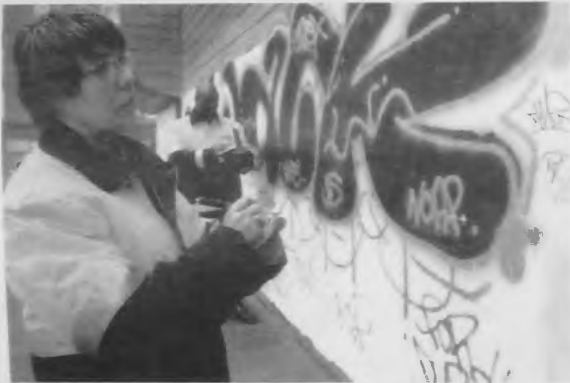
Getting the evidence - nowhere to hide for graffiti artists

W orking with the police and community, Neighbourhood Wardens are responding to real local needs - cracking down on the scourge of graffiti and abandoned vehicles and tackling all forms of anti-social behaviour.