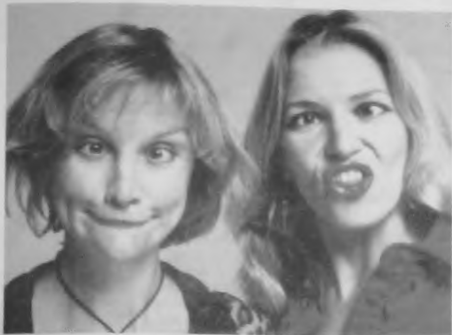
21 March, 8pm at the Bull 'The Weird Sisters Get Around'

Sunday 17 March 8th Annual Barnet Fun Run 2km family fun run starts 10.30am (fancy-dress is optional, spot prizes for the best costume) and a 10km race open to ages 16+ (starts 11am) at Cophall Stadium. Organised by Barnet's Leisure & Youth Service in aid of The Mayor of Barnet's appeal, Leukaemia Research Fund (Barnet & District). All finishers receive a commemorative medal and goody bag. For details and entry forms phone 020 8457 9907 or write to the Race Organiser, Cophall Pools, Great North Way, Hendon NW4 1PS