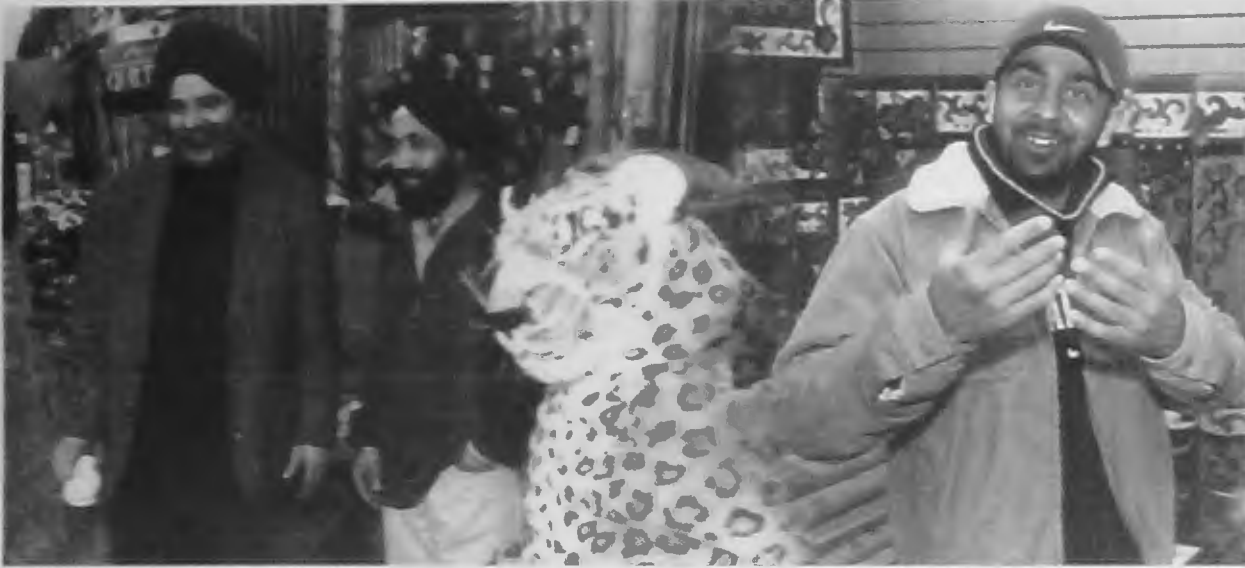
Local traders discuss the problems of graffiti in Burnt Oak's Watling Avenue

To bring the message of environment responsibility home to young people, the Council is planning anti-littering partnerships with local schools (see page 9).