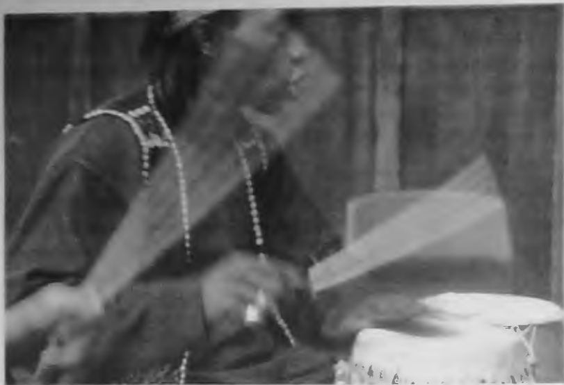
African drum workshops will be popular attractions

Opportunities to be a trade exhibitor at the event are still available. To book a stall, telephone Renae Randle on 020 8359 2339.