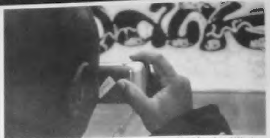
Another Graffiti tagger goes in the frame as your Neighbourhood Wardens step up the fight against this blight in our high streets