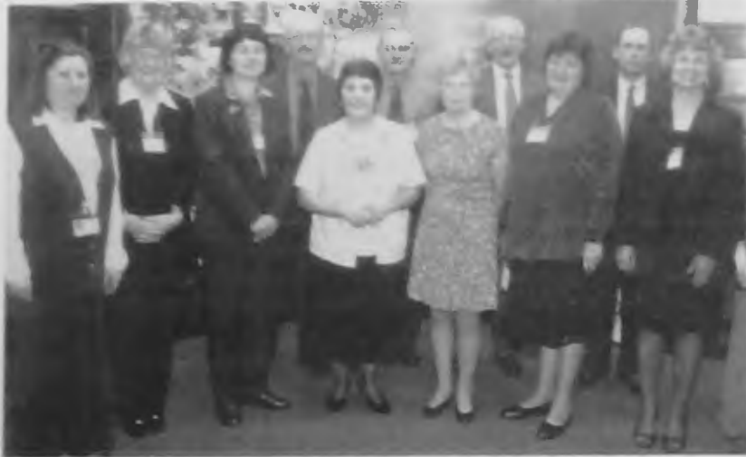
Just some of the staff behind Barnet's award-winning services