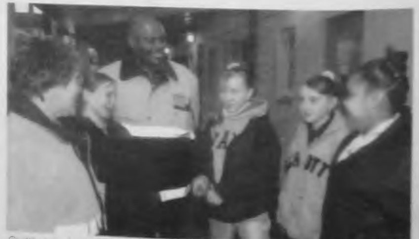
Getting to know local young people - they are part of the eyes and ears of the community too