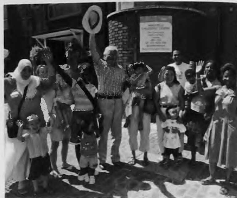
Celebrating Wingfield's opening

Barnet's first children's centre officially opened its doors to families last month.