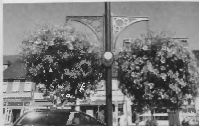
The JC Decaux Best Town Centre Trophy awarded to Mill Hill Broadway.