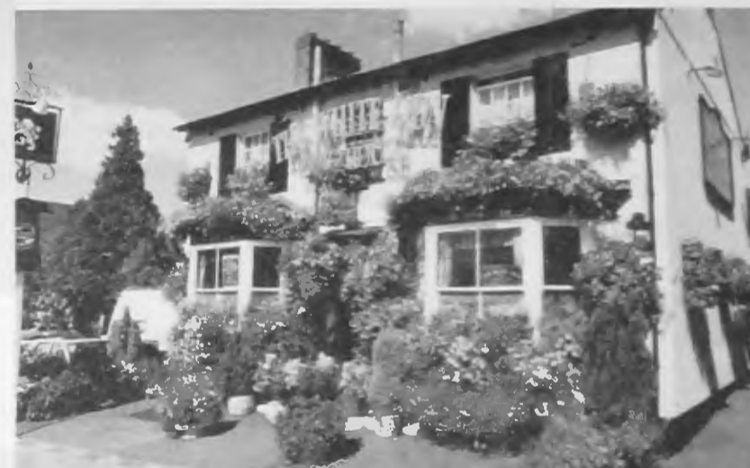
The White Lion Public House, St. Albans Road, Barnet, wins Best Bloomin' Pub.