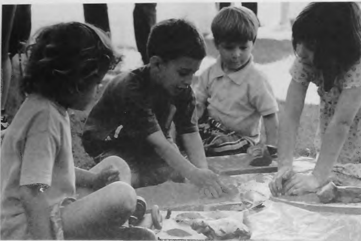
Barnet youngsters get down to a serious day's play at one of many events organised to celebrate Playday 98. The outing pictured above was held in Montrose Park, Burnt Oak.