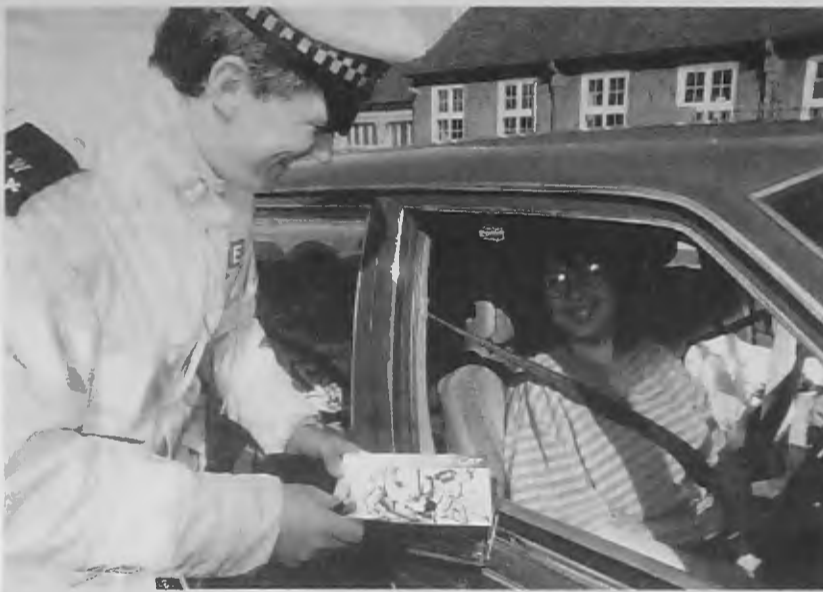
No problems here for one careful driver outside Wessex Gardens School obeying the life-saving 'Belt Up' rule for drivers and young passengers.

Both the Metropolitan Police and Barnet's Accident Prevention officers have been targeting parents on the school run, giving information and advice on belting up in the back and the consequences if they fail to do so. Too many children are still travelling in both the front and back seats without using their seatbelts. Shocking statistics show the failure by adults to use rear seat belts, which are now compulsory. In a recent survey, only half of those travelling in the back were wearing seatbelts.