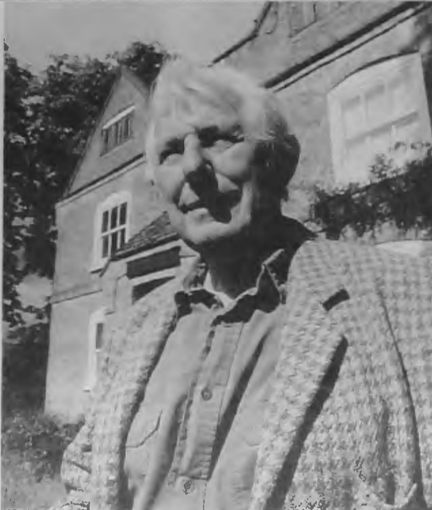
Dannie Abse outside Church Farmhouse Museum, where an exhibition on his life and work is attracting many visitors and widespread media attention.