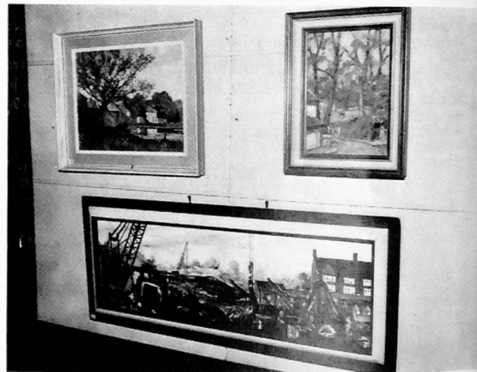
Three of the paintings in the Barnet Today Exhibition, currently on display at East Finchley Library.