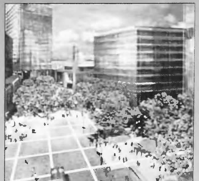
A new look for Brent Cross and Cricklewood

Consultancy group EDAW have taken away the results of this first consultation, and are drawing up new plans for the area which will be available in October. Provisions will be made for residents to once again air their views on this important project - watch this space!