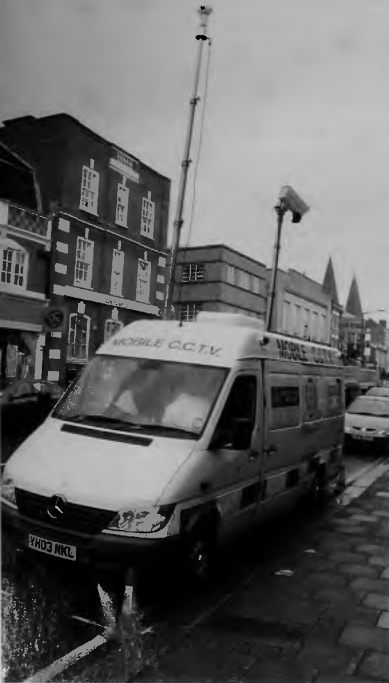
Barnet's new mobile CCTV unit

There has also been major investment in CCTV. A mobile unit packed with state-of-the-art surveillance equipment is now patrolling Barnet's crime hotspots. This latest weapon in the fight against crime, vandalism and anti-social behaviour follows the installation of more cameras in town centres and the opening of a new CCTV control centre.