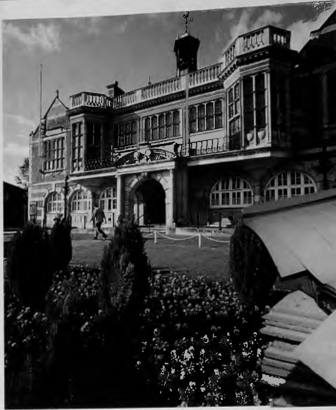
Above Hendon Town Hall. Right, Hidden treasures on display within the building