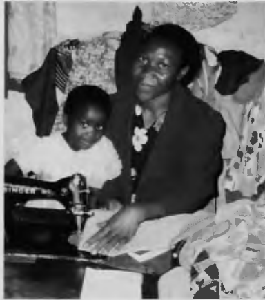
Recycled sewing machines are put to good use, helping to improve opportunities for communities in developing countries

Instead of ending up in landfill sites or as scrap metal, the donated items are repaired by volunteers and then shipped to vocational training centres in developing countries, mostly in East Africa.