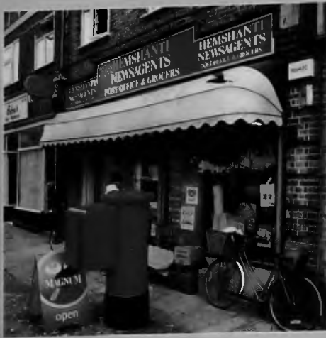
Sunny Gardens Parade Post Office in Hendon