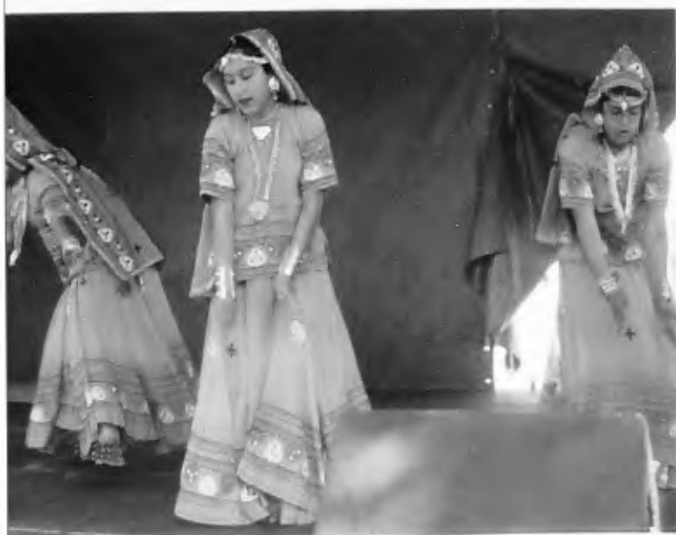
Local children perform with the Sariswati Academy of Indian Dance on the Community Stage

Around 10,000 people flocked to children's arts festival Play! in July, organised by the council's arts team in partnership with other agencies and early years groups.