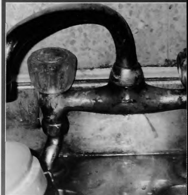
Grime and punishment: Filthy kitchen uncovered

When Environmental Health Officers inspected the premises they found a number of problems, including kitchen equipment encrusted with food debris and mould, no hot water to the toilet wash basin and unhygienic storing and handling of food.