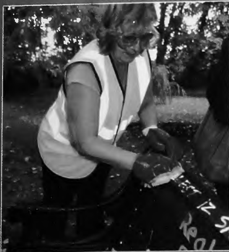
The council's anti-graffiti pack goes into action

Barnet Council has launched an anti-graffiti kit as part of its bid to create a cleaner, greener borough. The measure is part of the council's crackdown on graffiti which has already seen the introduction of three fast-reaction, in-house graffiti removal teams and means reported graffiti is now deleted free of charge from buildings facing main A roads such as the A1000 within 48 hours.