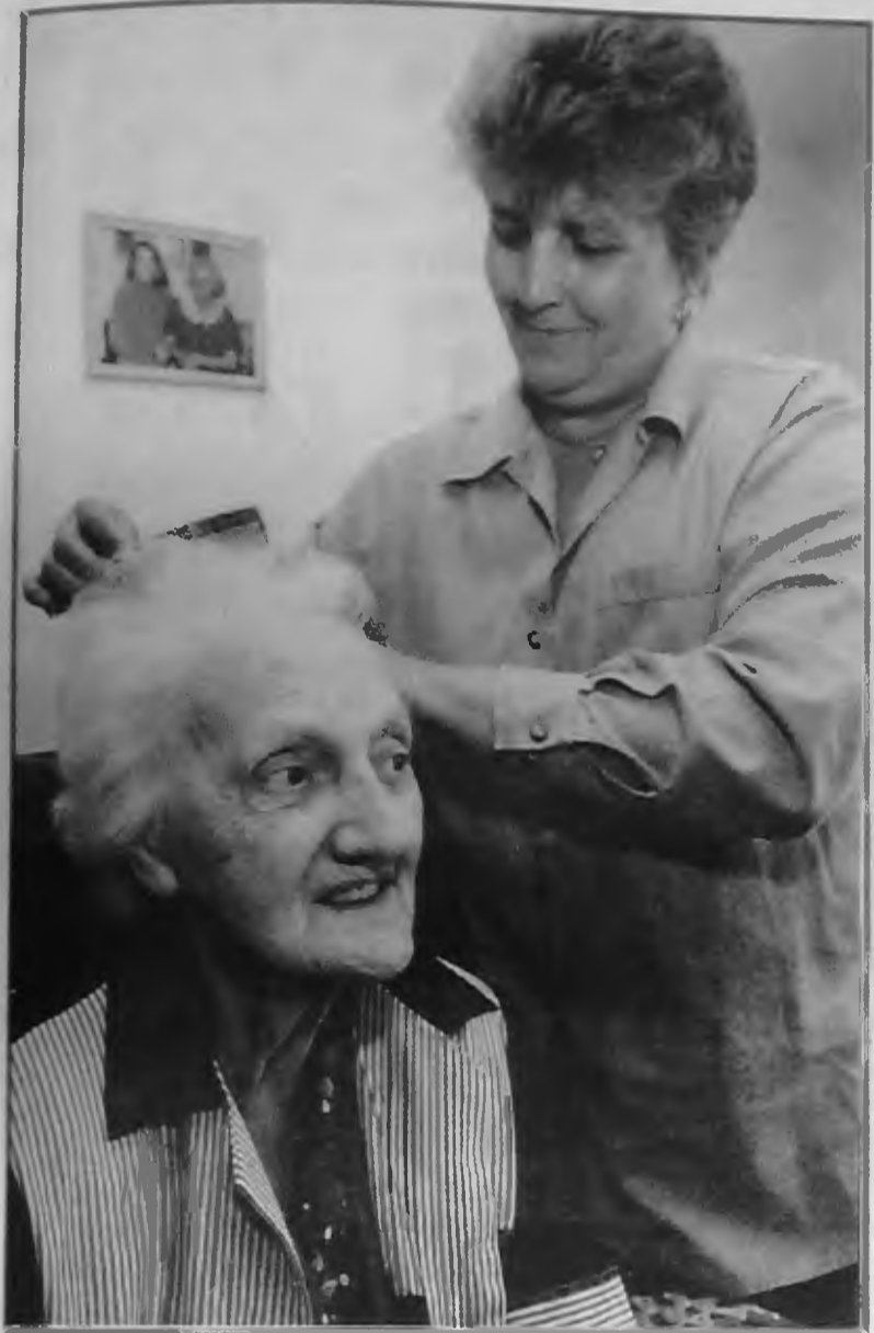
A little hair care provides a morale boost for another client

W HEN A Council officer visited an 89-year-old woman in answer to her call for help about a defective window, he found she had been unable to get into the bath for 17 years because of her disability.