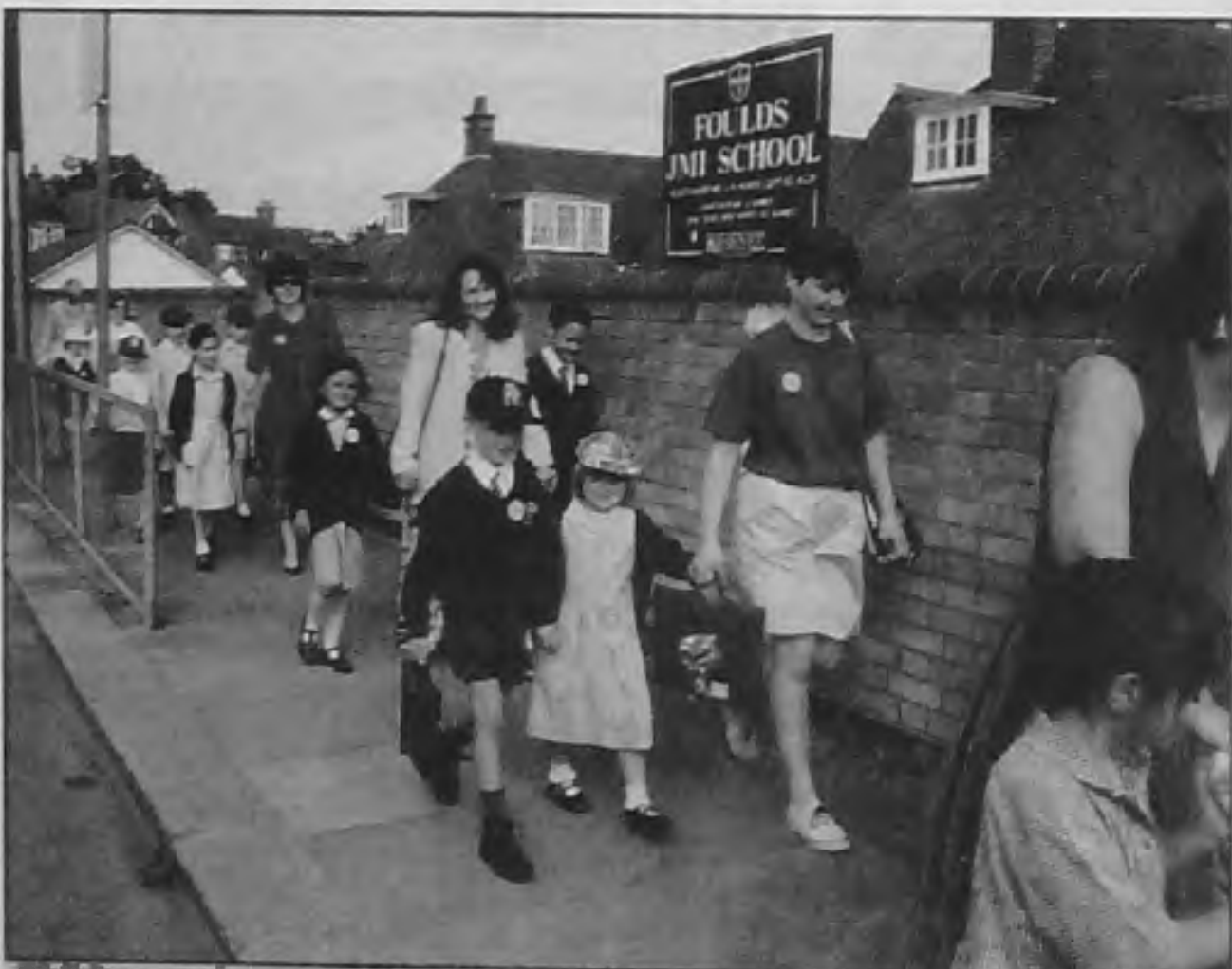
Children and parents from Foulds JMI School in Barnet put their best foot forward during Walk to School Week in the summer.

Advice on housing and council tax benefits, council tax and education awards will be available from the Finance Directorate's Customer Services from 10am to 4pm on Tuesday 12 November 1996 at Tesco, Coppetts Wood.