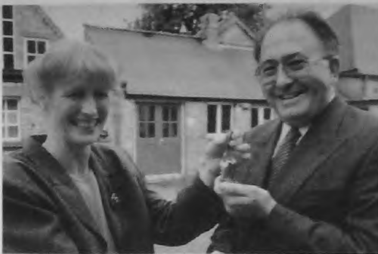
It is all systems go now for the Greek Cypriot Brotherhood after they received the keys to their new community centre.