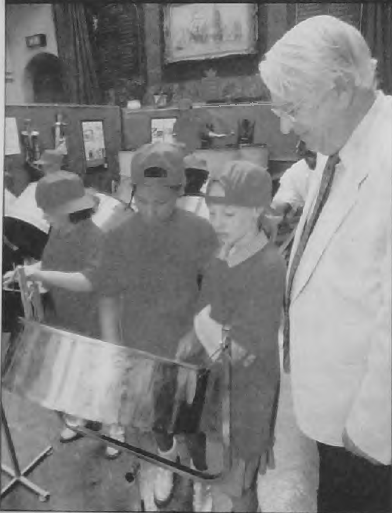
The council's tenth annual multicultural education resources exhibition had a special visitor to officially open the two-day event.

Donald Woods, former editor of South Africa's "Daily Despatch" and internationally-famous anti-apartheid campaigner, started off the country's largest shop window on the world of teaching aids (books, leaflets, posters, cassettes, music and software) for multicultural education.