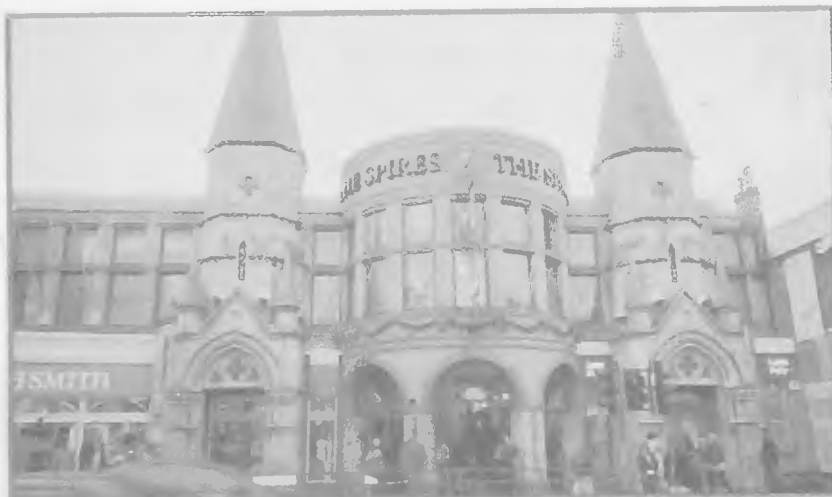
The Spires . . . Barnet