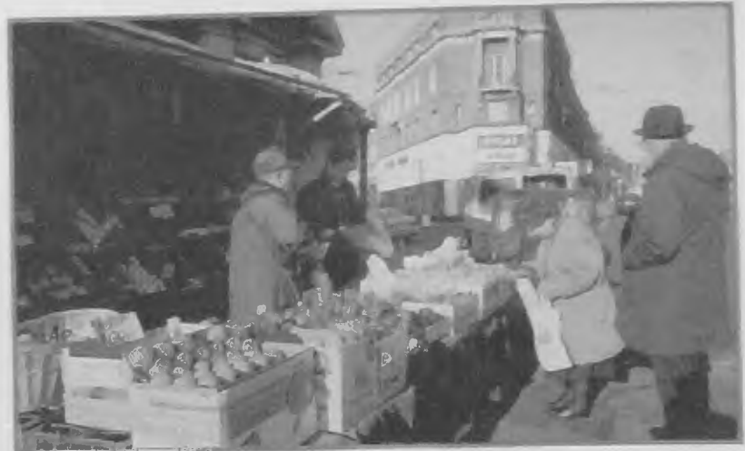
Street Trader . . . Temple Fortune