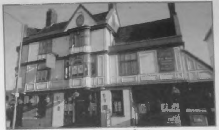
Tally Ho Pub . . . North Finchley

Here are just a few of the attractions on offer.