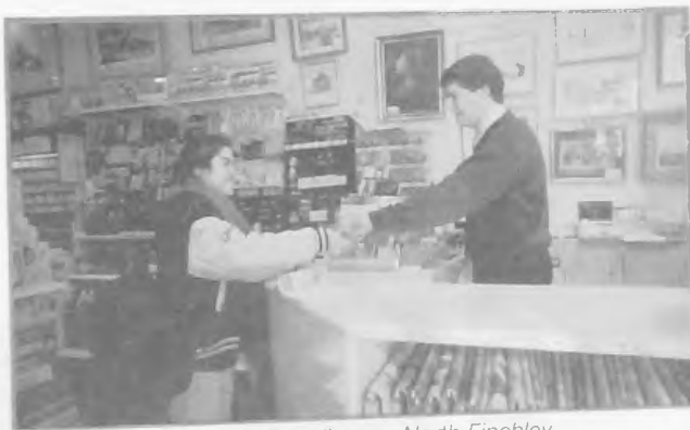
Fine Arts Supplies . . . North Finchley