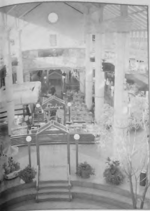
Broadwalk . . . Edgware