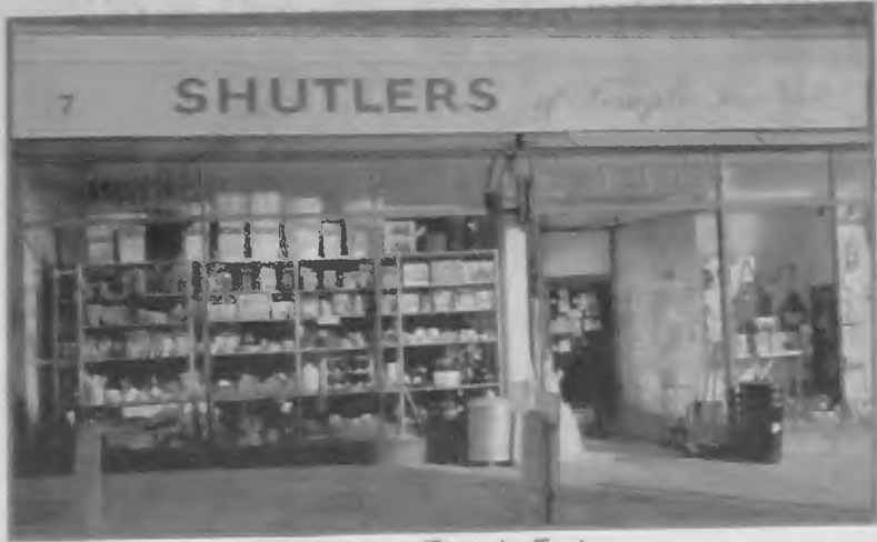
Shutlers . . . Temple Fortune