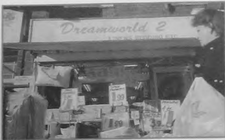
Watling area . . . Burnt Oak