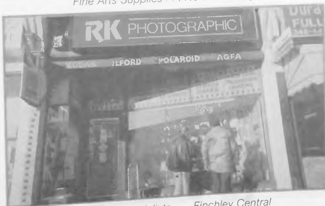
Dark room specialists . . . Finchley Central