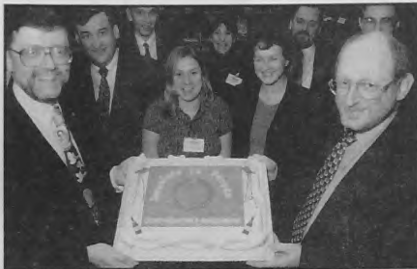
IT'S A PIECE OF CAKE:

Investors in People is a national scheme which requires organisations to meet high standards of employee communication, training and development.