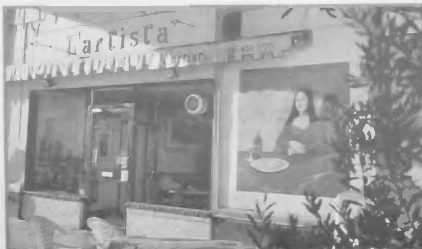
L'artista Restaurant . . . Golders Green