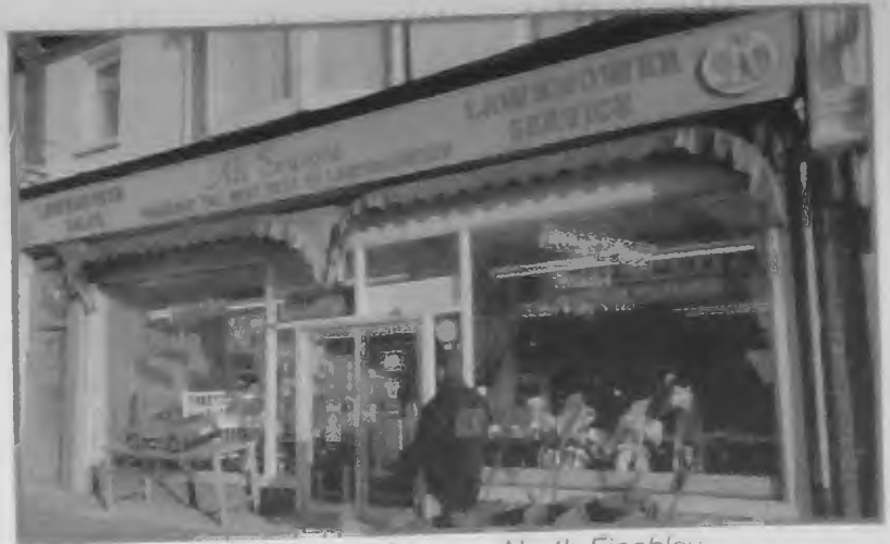
Lawnmower shop . . . North Finchley