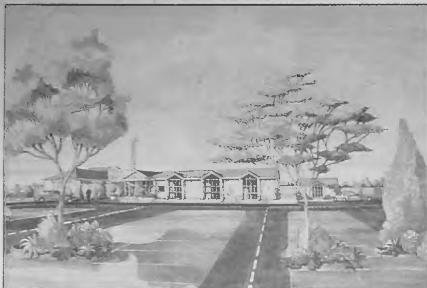
AN ARCHITECT'S IMPRESSION: of how the new building will look.

The Electoral Registration Officer, Barnet Council, Ravensfield House, The Burroughs, Hendon, London NW4 4BE.