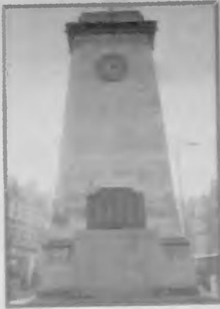
War Memorial Golders Green