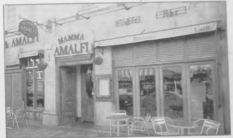
Mamma Amalfi Restaurant . . . Edgware