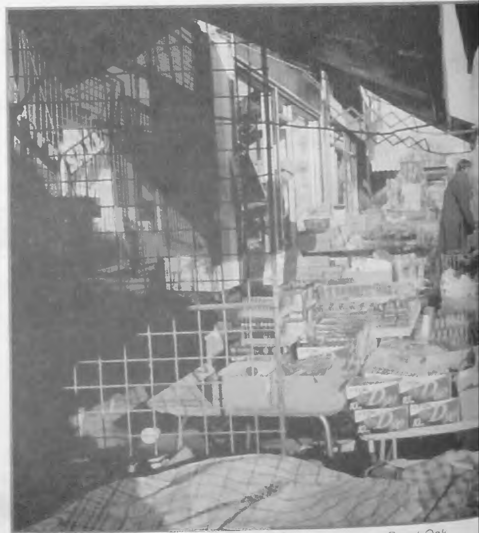
Watling Area . . . Burnt Oak