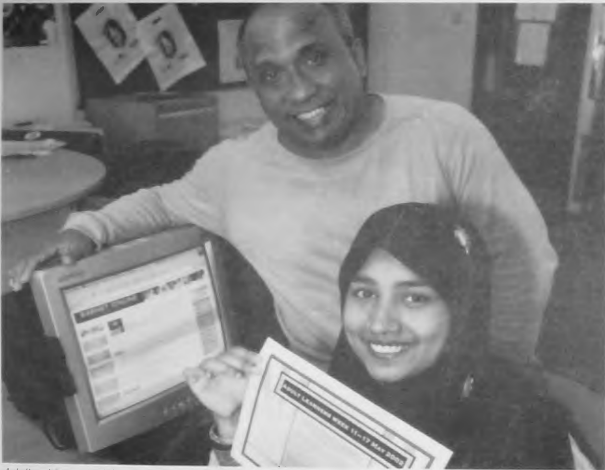
Adult achievers celebrate at the opening of Barnet's new learning centre at East Barnet Library