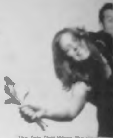
The Tale That Wags The Dog

8 & 9 June, 8pm. A & BC Theatre 'The Tale That Wags The Dog'. £9/£7 conc. 11 June, 7.30pm. Capital Arts Theatre School 'Jolly Hockey Sticks'. Proceeds to Future Trust - the Afghanistan crisis charity. £8/£6 conc. 13 June, 8pm. Angela de