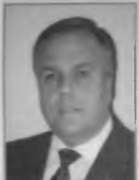
TOTTERIDGE WARD COUNCILLOR BRIAN COLEMAN (Con) Greater London Assembly Member for Barnet & Camden