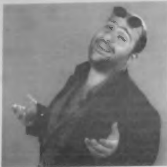
Omid Djalil - Edinburgh Comedy Preview at The Bull on 21 July, 8pm