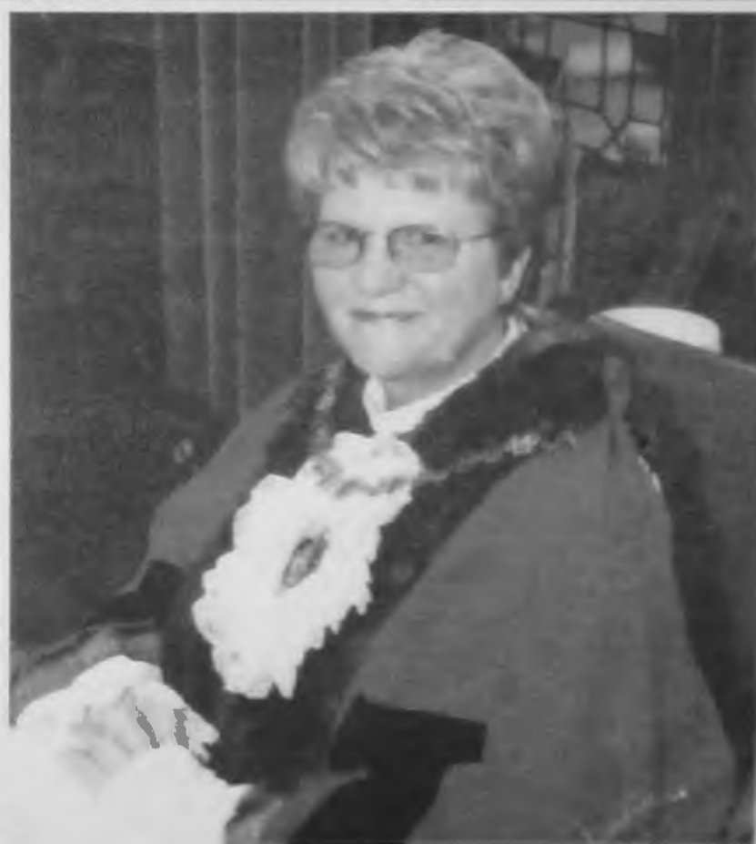
Councillor Joan Scannell the new Mayor of Barnet.