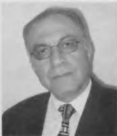
Deputy Mayor Councillor Andreas Tambourides

More news of the Queen's visit to Barnet on Page 3.