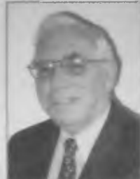
TOTTERIDGE WARD COUNCILLOR VICTOR LYON (Con) Leader of the Council (Conservative Group Leader)