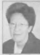
EAST FINCHLEY WARD COUNCILLOR HELEN GIFFORD UK Independence Party