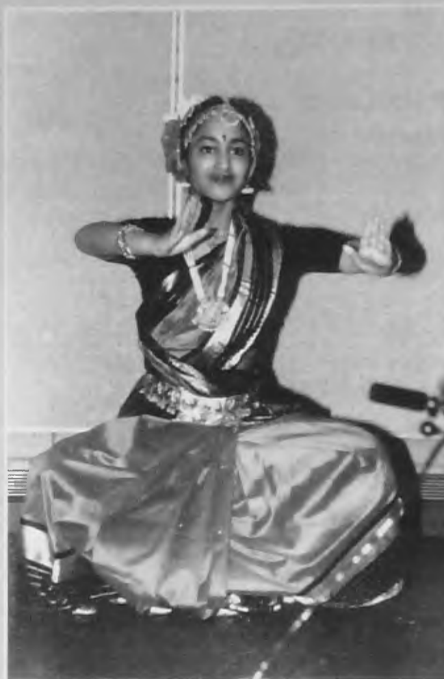
Children will perform Indian, African, Greek, classical and contemporary dance.

For further details about Dance Festival 2000 please call 0181 359 3924.