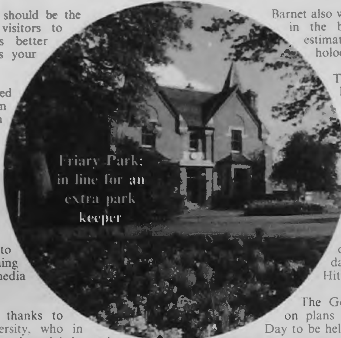
Friary Park: in line for an extra park keeper

Sunday opening - which runs from 2pm to 5pm - is part of Barnet's continued emphasis on improving services and has particularly been welcomed by the borough's large Jewish community for whom Saturday is the Sabbath.