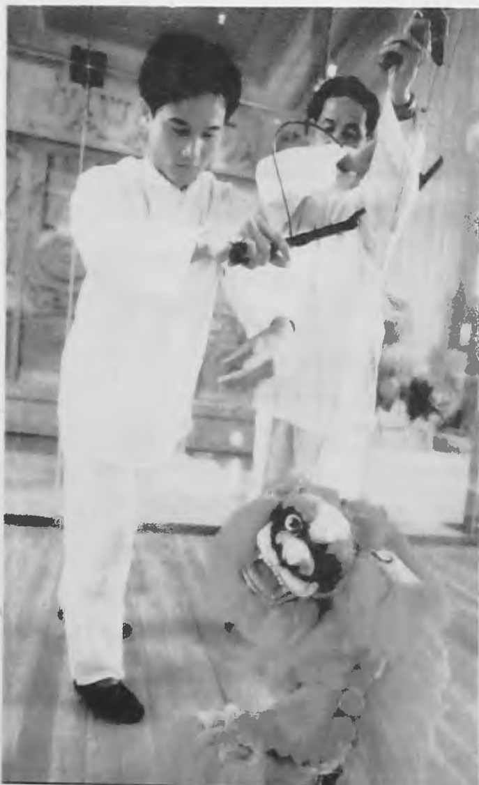
The Quanzhou Puppet Theatre Troupe in 'Fire Dragon 2000'