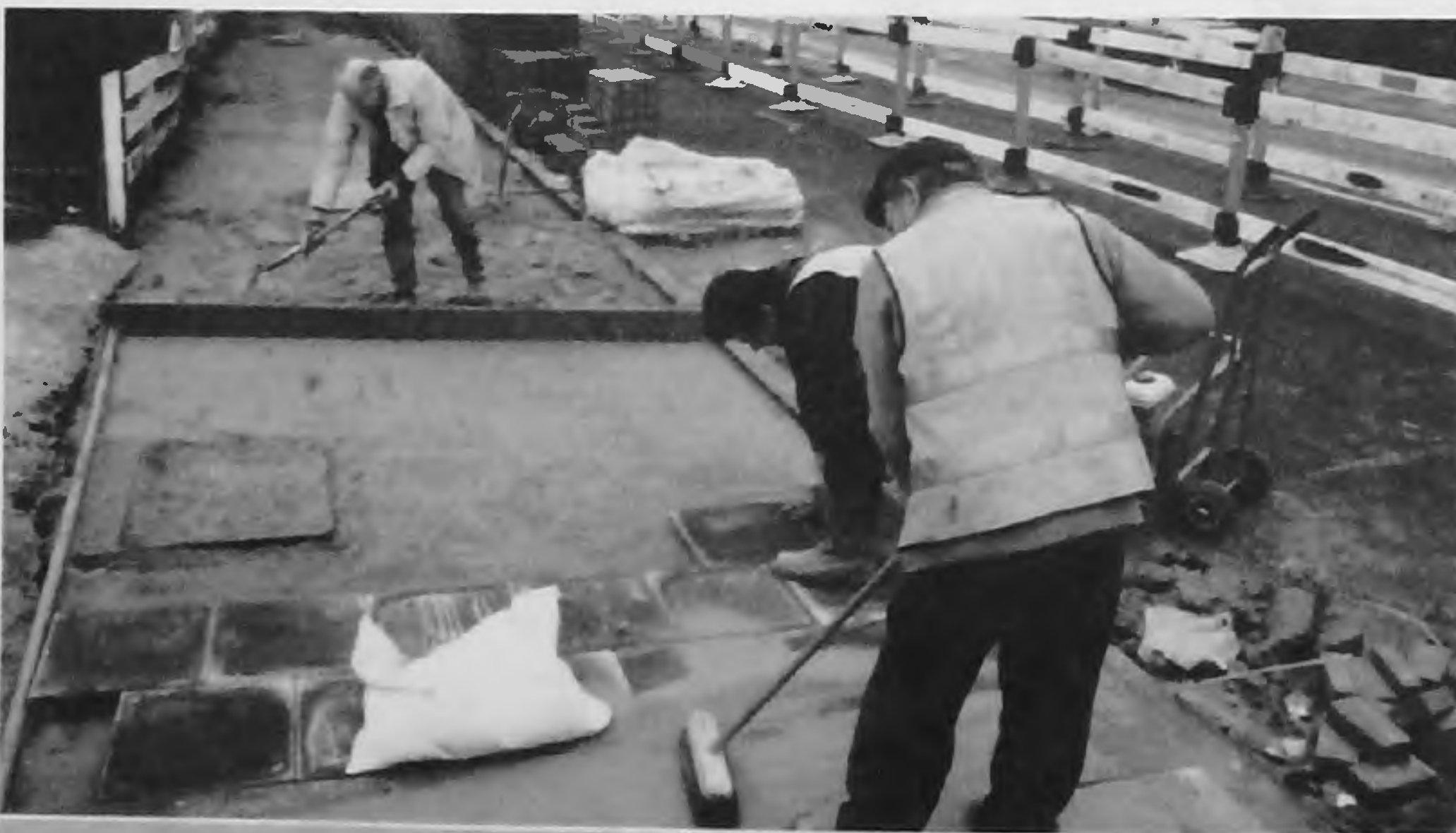
An extra £550,000 is proposed to improve roads and pavements.

A BOLDER, brighter, better Barnet! That's the key message in this year's budget with street based services the priority.