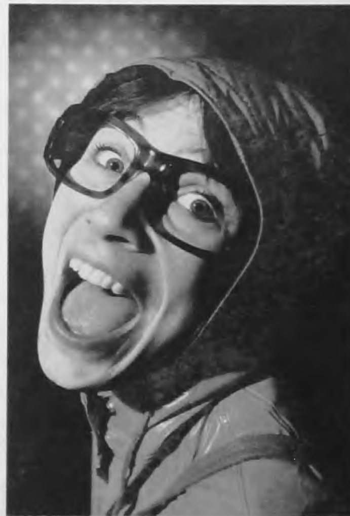
"Living like Victor" - contact The Bull 0181-449 0048 for details