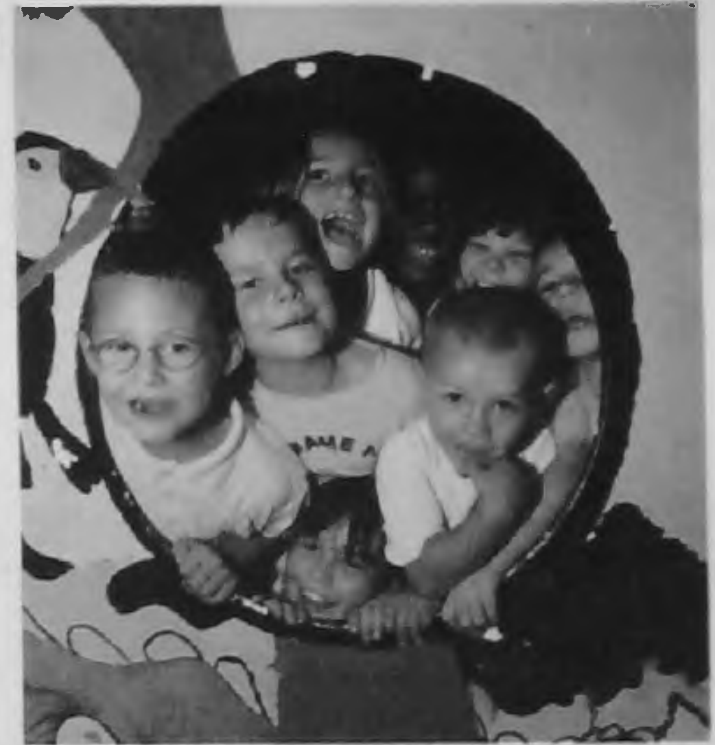
The Log Cabin Adventure Playground, Grahame Park, would get £15,500

This is done by planning, organising and delivering an alternative education system, based at a youth centre, resourced by the Youth Service with a contribution from the school the young person should have attended. This involves a series of courses that emphasise key skills and personal development.