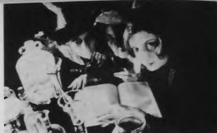
Brouhaha present 'Witch Hunt', at the Bull, High Street Barnet on 10 March, 8pm Black witches converted to white with endless cups of tea. Brouhaha uses pure visual comedy to explore themes covering the hidden side of human existence. £8, £6 conc.

12 Feb, 1-4pm, Edgware Symphony Orchestra playing at the Broadwalk, Edgware; 12 Feb, 7.45pm, Chamber Music Concert by The Aylwin String Ensemble (members of the BBC Symphony Orchestra) in St