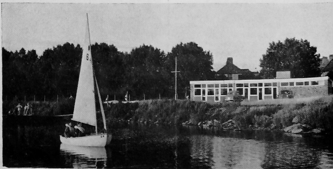
A view of the Welsh Harp Sailing Base, Cool Oak Lane, Hendon, which provides excellent facilities for young people to learn the arts of sailing.

A Youth Handbook is published once every two years, and a copy may be obtained from the Youth Officer at the Town Hall, Hendon.